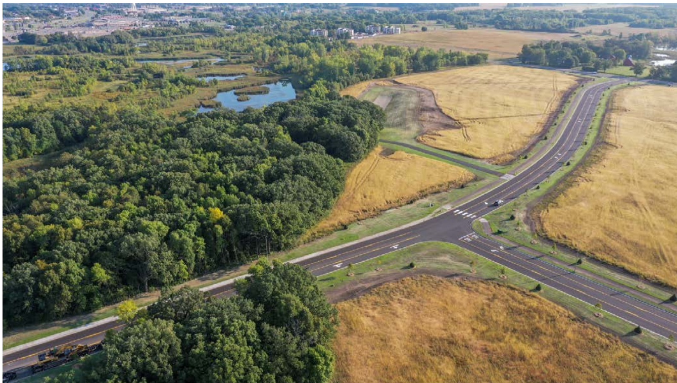
Alexandria 44th Avenue project