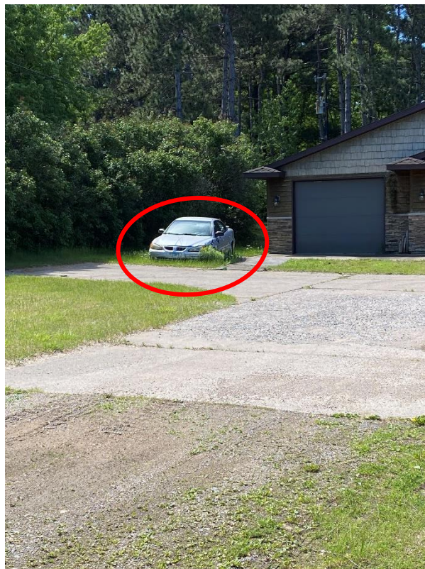
Exhibit 1: Evidence of violation on the Property

Bria Raines, Zoning Code Enforcement Officer (763) 433-9840 | braines@cityoframsey.com