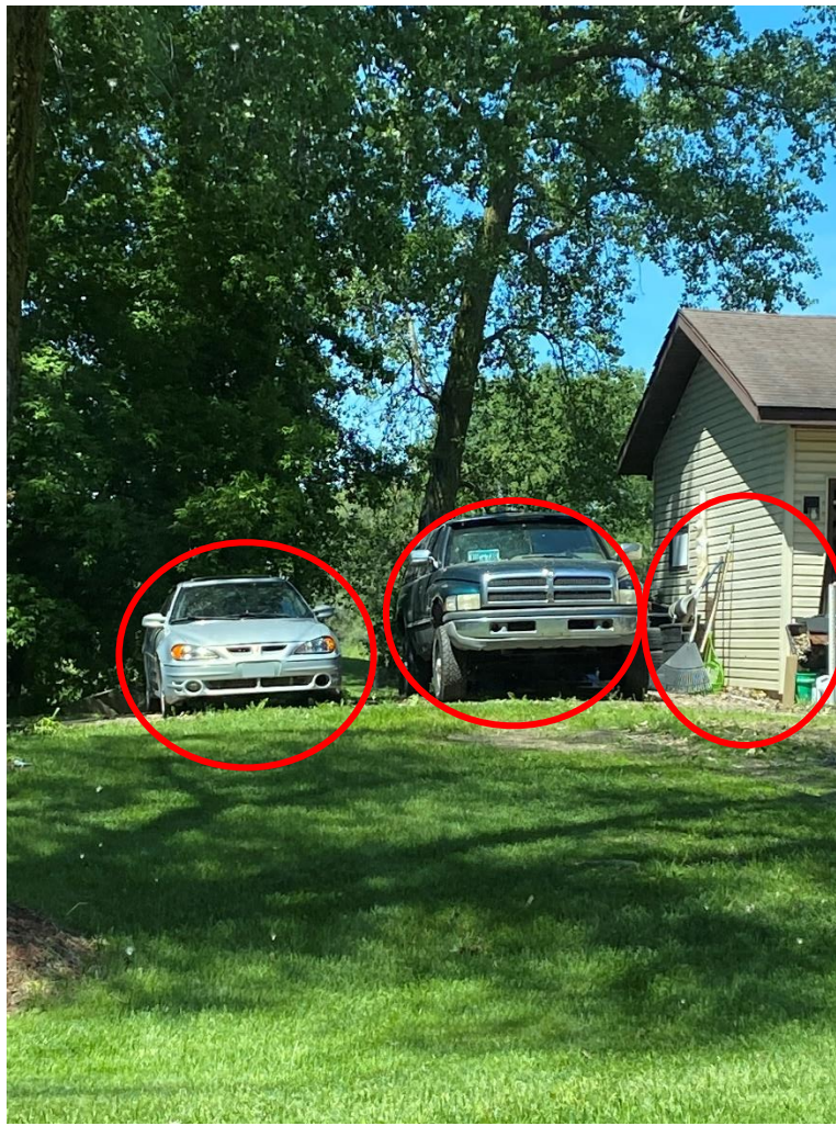
Exhibit 1: Evidence of refuse and parking violations on the Property

Bria Raines, Zoning Code Enforcement Officer (763) 433-9840 | braines@cityoframsey.com