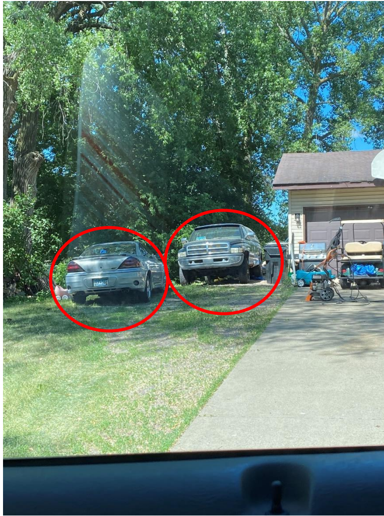
Exhibit 1: Evidence of parking violations on the Property

(763) 433-9840 | braines@cityoframsey.com