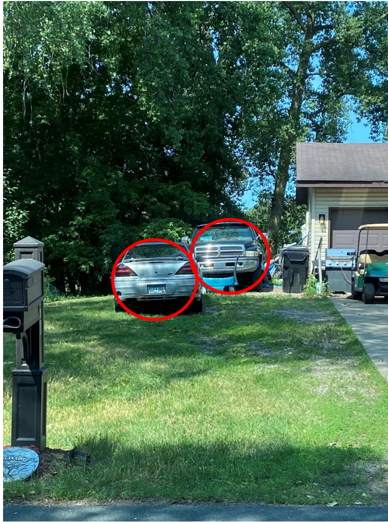
Exhibit 1: Evidence of parking violations on the Property

(763) 433-9840 | braines@cityoframsey.com