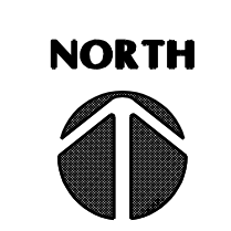
1 SITE PLAN A1 SCALE: 1" = 60'-0"

NOTE: SITE PLAN CREATED WITHOUT THE BENEFIT OF A RECENT LAND SURVEY OR ACCURATE BOUNDARY INFORMATION