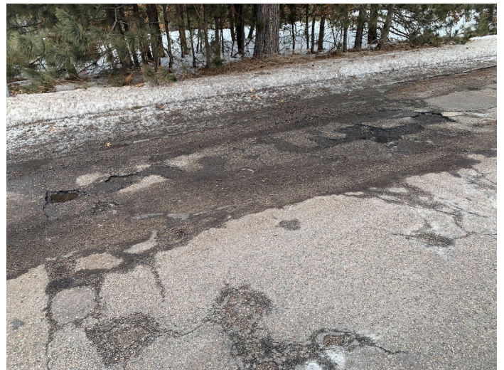
Figure 4: Potholes along 161st Ave NW

In addition to the significant deterioration of the road, there are several areas where water ponds on the surface of the road, including two areas along 161 st and at the intersection of Variolite and 161 st . The significant amount of impervious surface that will be constructed as a result of this proposal will result in additional runoff, leading to rapid deterioration of any new infrastructure.