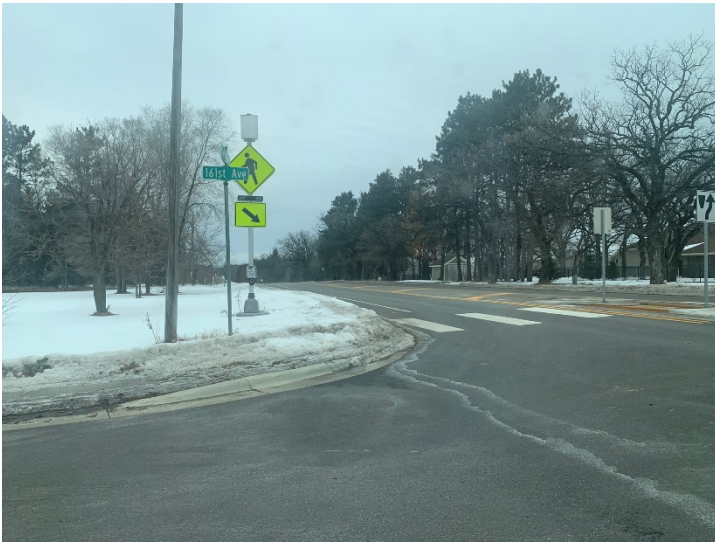
Figure 2: View from SUV on 161st Ave NW from West

Safety: The intersection of 161 st Ave NW and Variolite Street has been a concern of residents for many years. Residents have brought concerns forward to the City on multiple occasions. Most recently the reconstruction of Variolite added pedestrian crossing signals above and below the hill, along with a safe zone in the middle of the intersection for crossing pedestrians. Speed limits were changed in this area, as well. These improvements have made a minimal impact on pedestrian safety. Cars continue to travel along Variolite at high speeds. The reconstruction of Variolite made sight lines worse at the intersection of 161 st Ave NW.