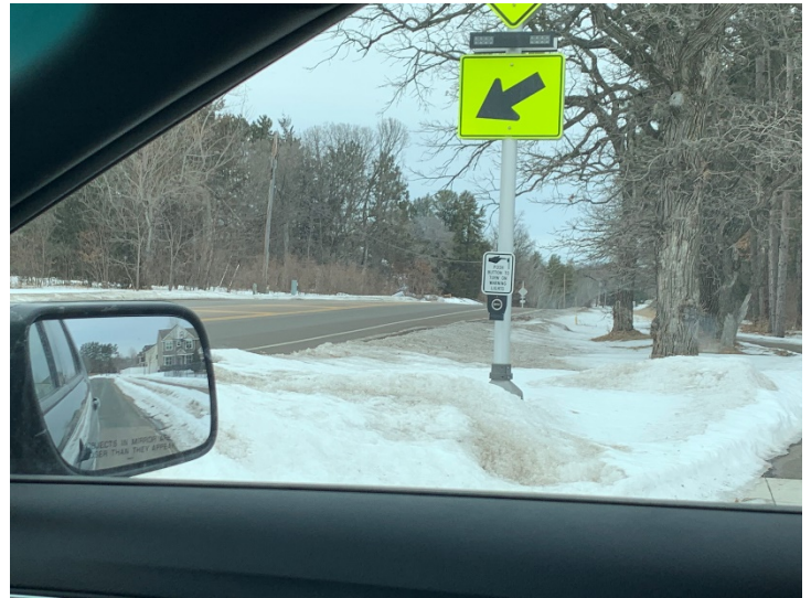
Figure 3: View from SUV on 161st Ave NW from East

It is extremely difficult to see cars traveling south on Variolite as they approach the intersection at 161 st Ave NW. Per the contour lines on the proposed plan, there is a drive lane that spills out onto the middle of the hill that causes the sight line issues. At peak times, the traffic entering Variolite from this drive lane will make it impossible to safely cross at 161 st Ave NW.