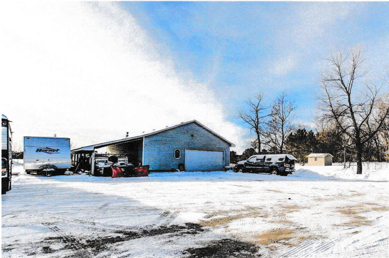
EXISTING DETACHED GARAGE