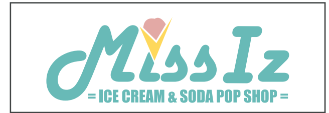
(x2) Tenant Panel Graphic for top half section