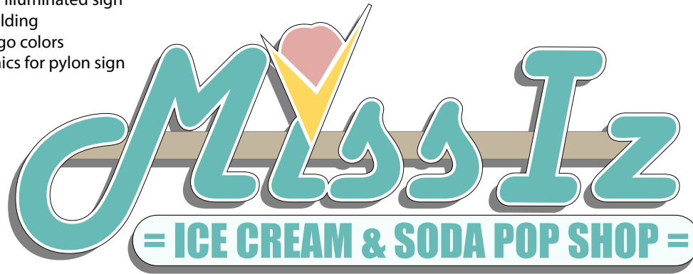
(x1) Illuminated sign on Raceway