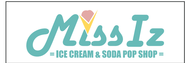
(x2) Tenant Panel Graphic for top half section