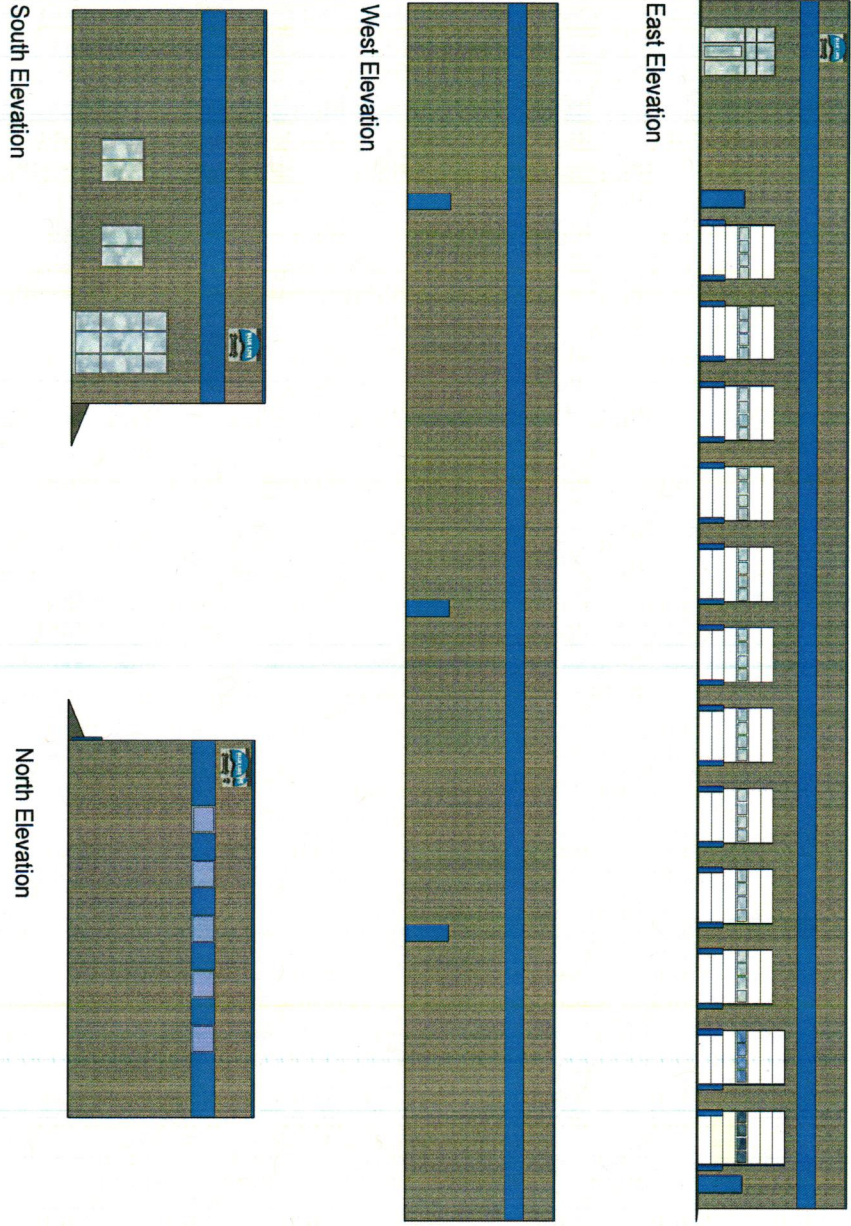
EXHIBIT B (Continued)