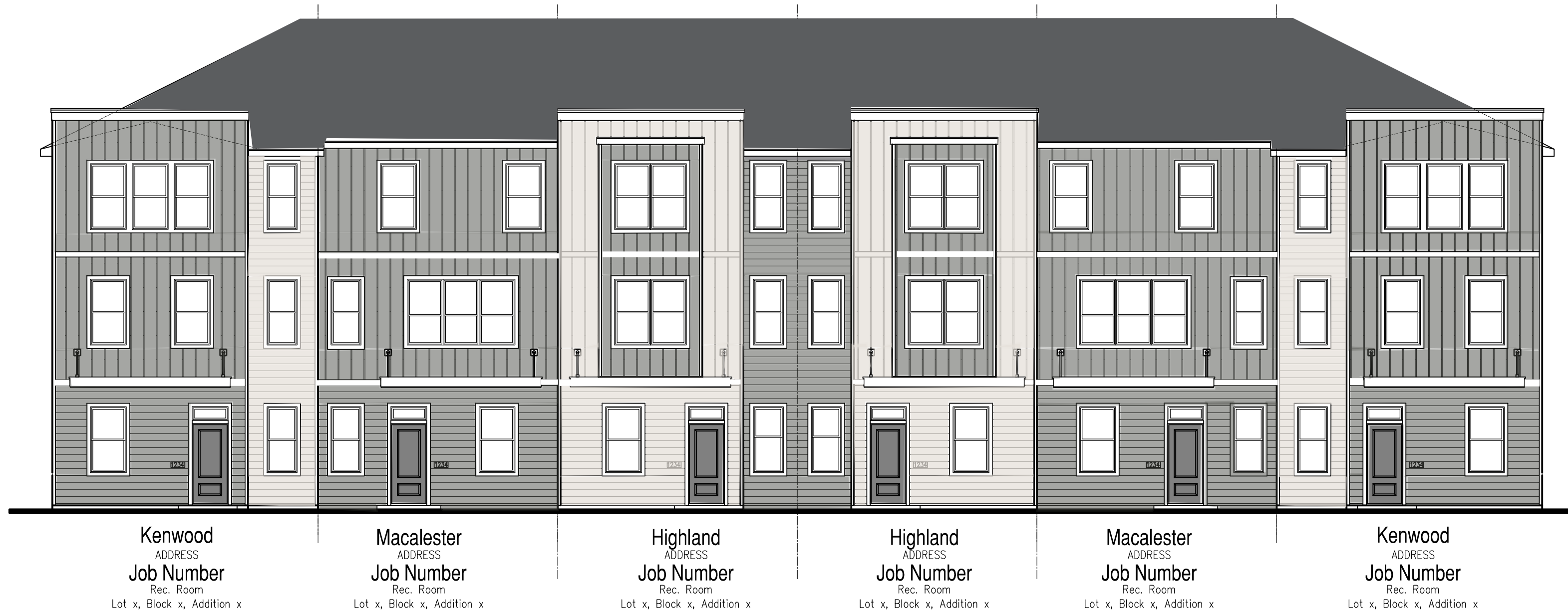
1 Front Elevation 1/8"=1'-0"