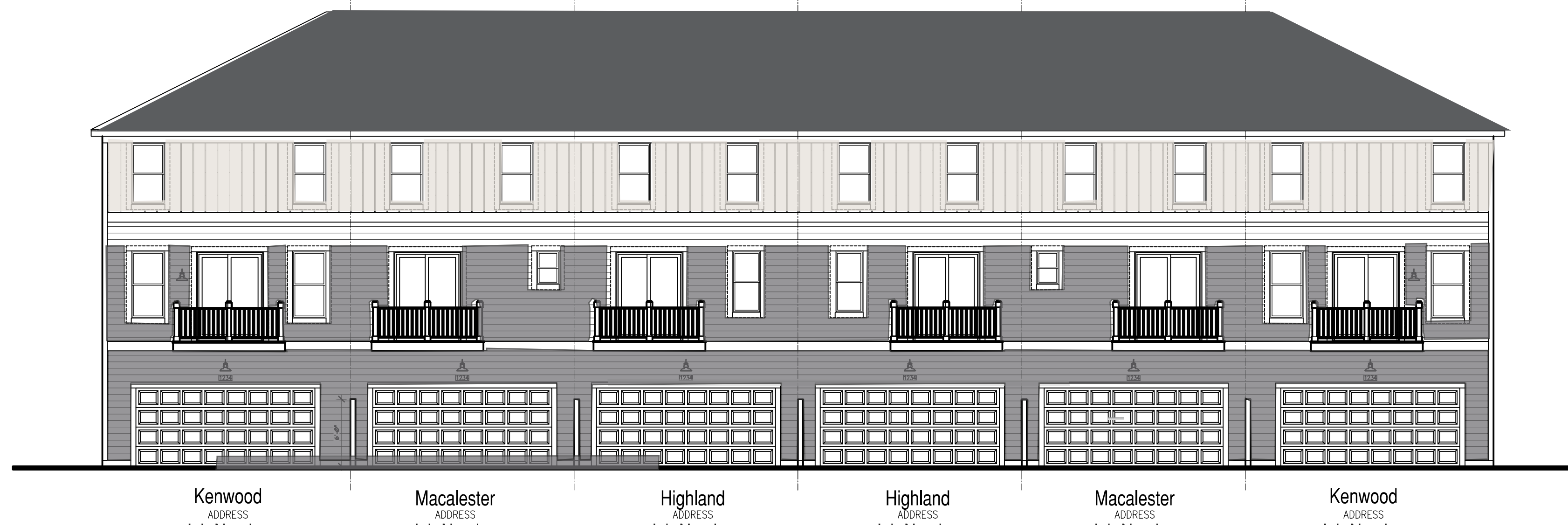
4 Rear Elevation 1/8"=1'-0"