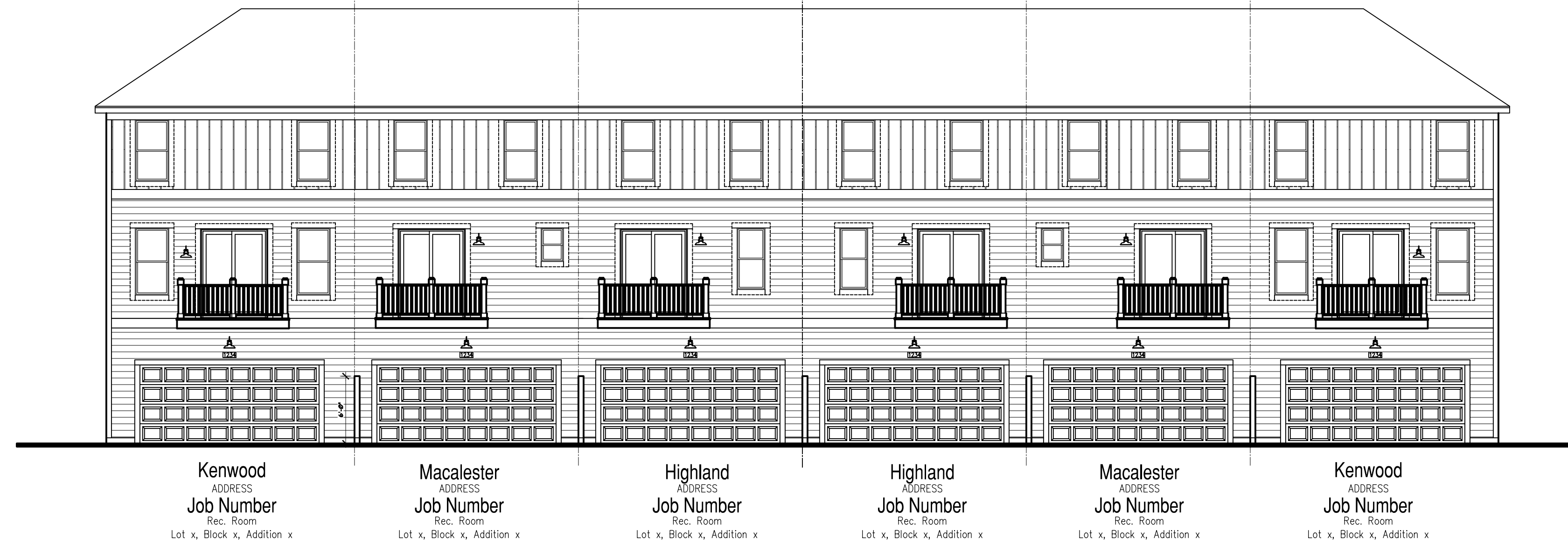
4 Rear Elevation 1/8"=1'-0"