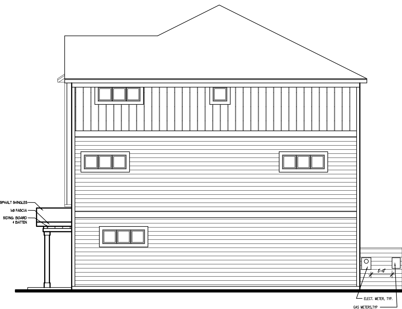
2 Right Elevation 1/8"=1'-0"