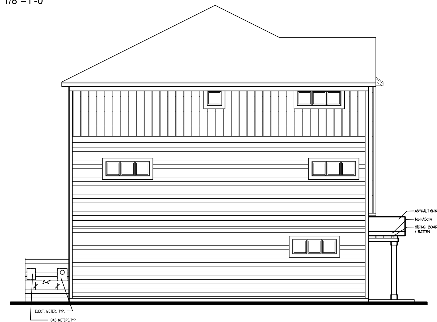
3 Left Elevation 1/8"=1'-0"