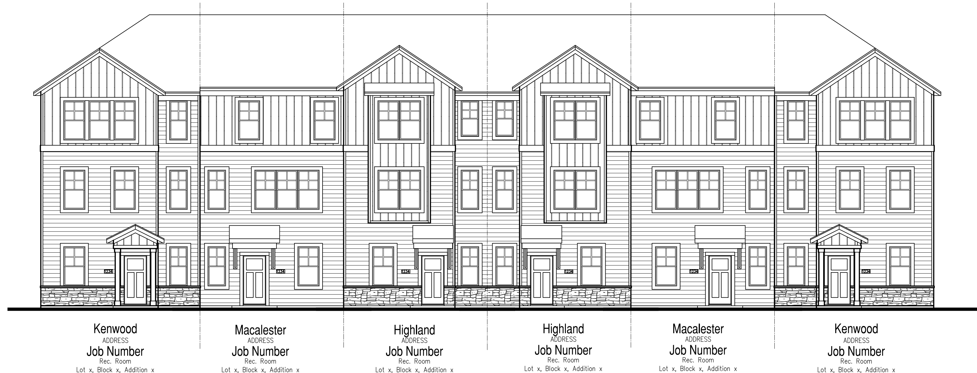
1 Front Elevation 1/8"=1'-0"