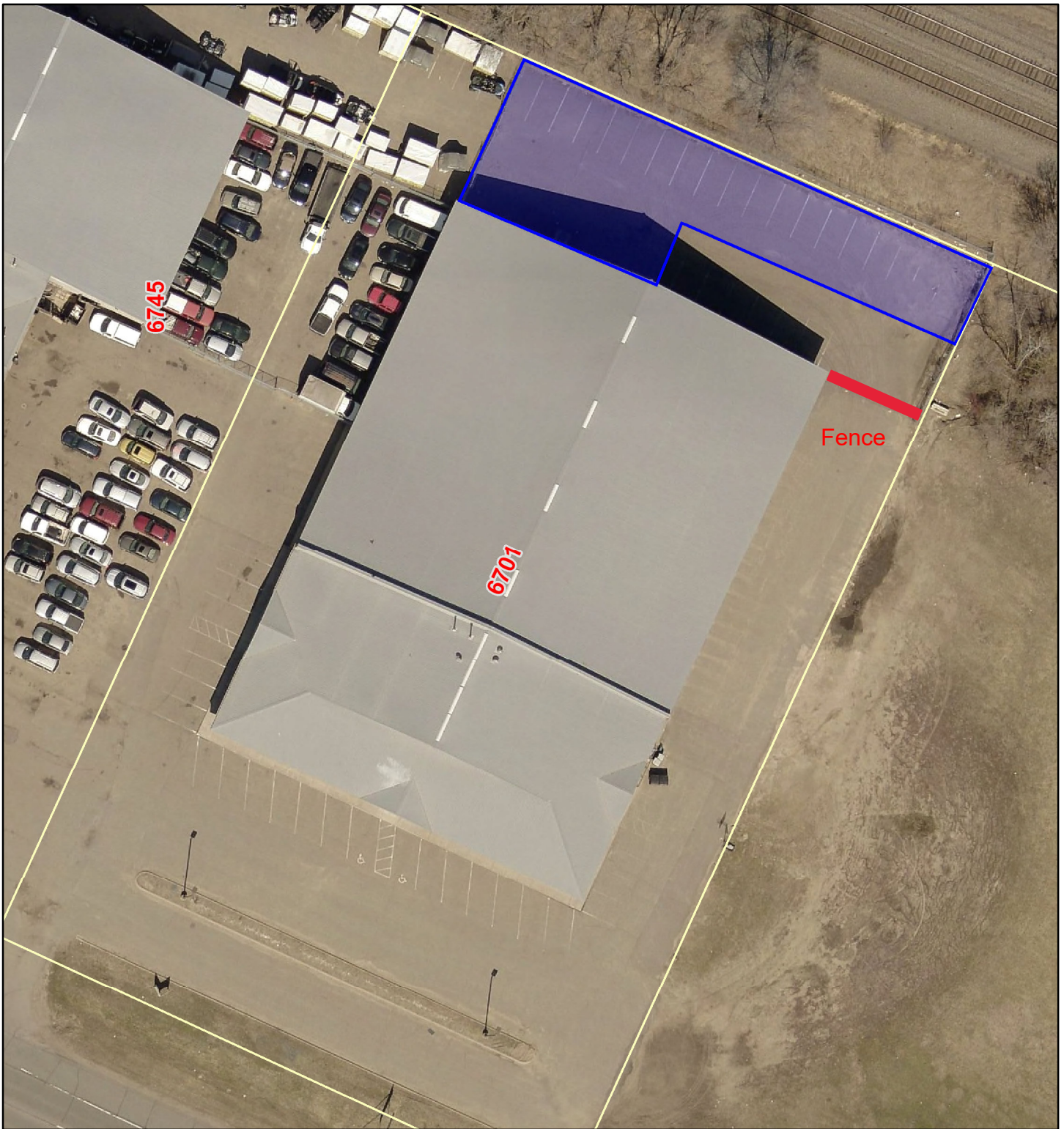
Exhibit A Lease Area - 6701 Hwy 10 NW