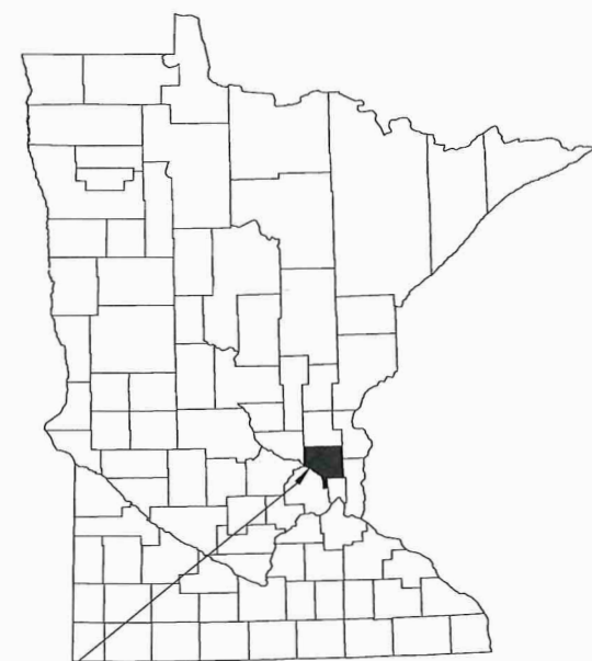
CITY OF RAMSEY ANOKA COUNTY, MINNESOTA DISTRICT: METRO

THE SUBSURFACE UTILITY INFORMATION IN THIS PLAN IS UTILITY QUALITY LEVEL D. THIS QUALITY LEVEL WAS DETERMINED ACCORDING TO THE GUIDELINES OF CI/ASCE 38-02, ENTITLED "STANDARD GUIDELINES FOR THE COLLECTION AND DEPICTION OF EXISTING SUBSURFACE UTILITY DATA."