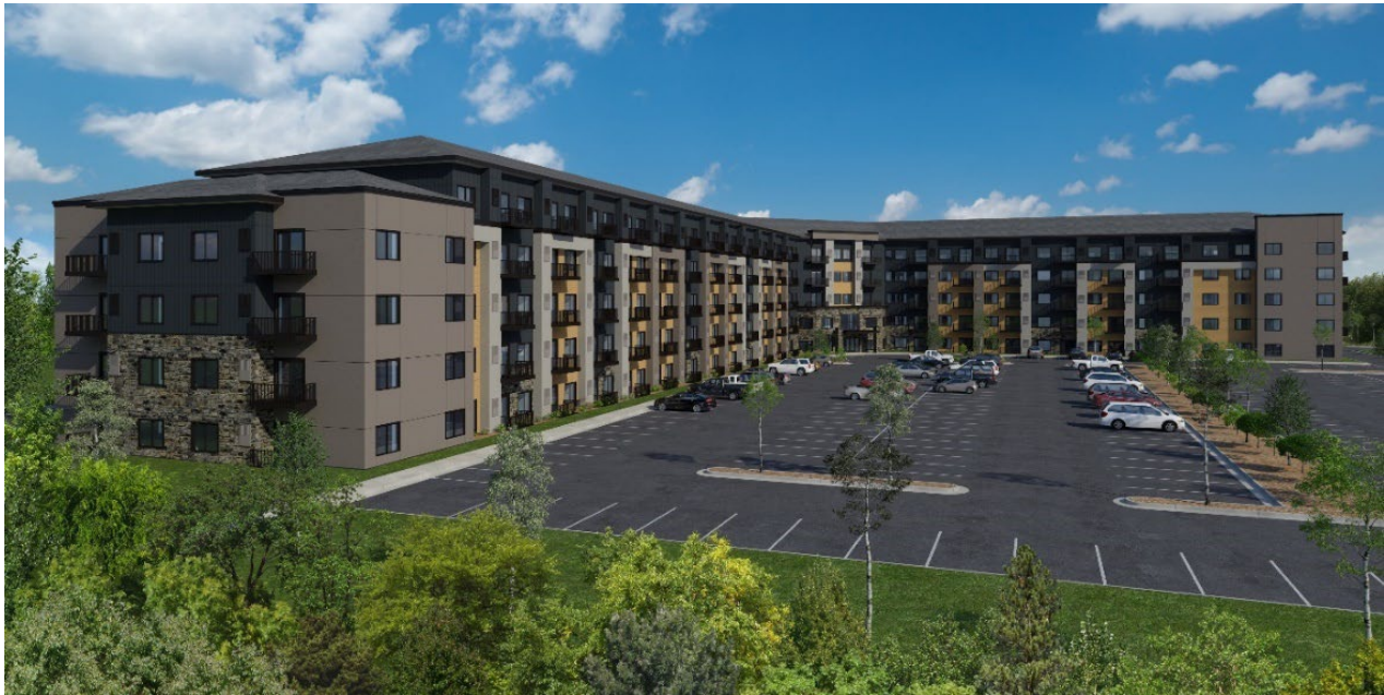
LEXINGTON LOFTS, CIRCLE PINES

We look forward to being a part of the City of Ramsey!