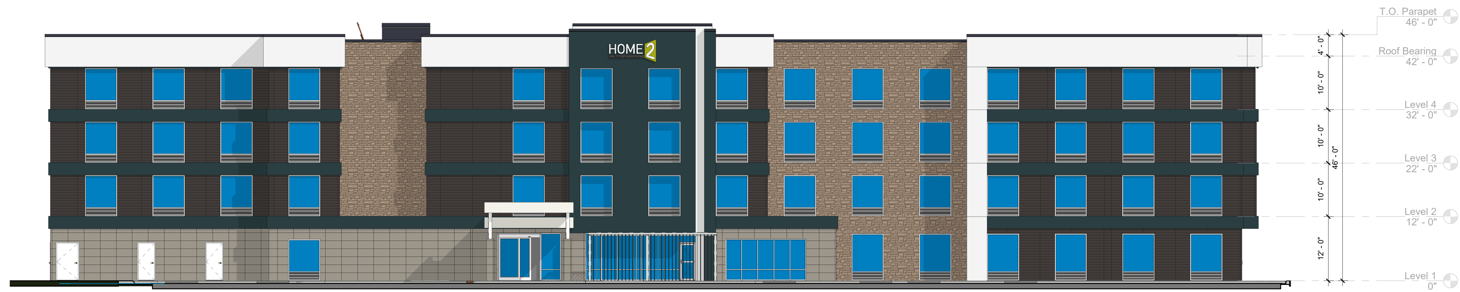
1 Building Elevation - North A403 3/32" = 1'-0"