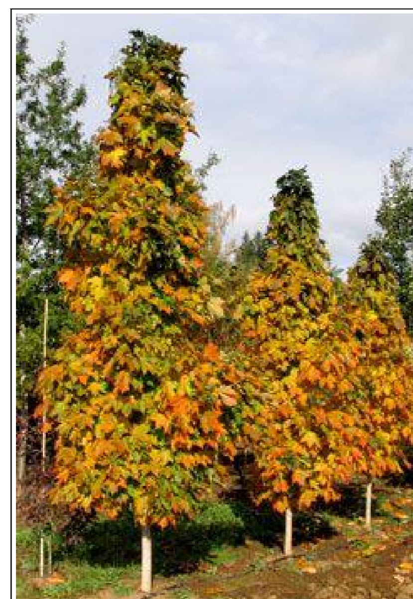
SUGAR CONE MAPLE