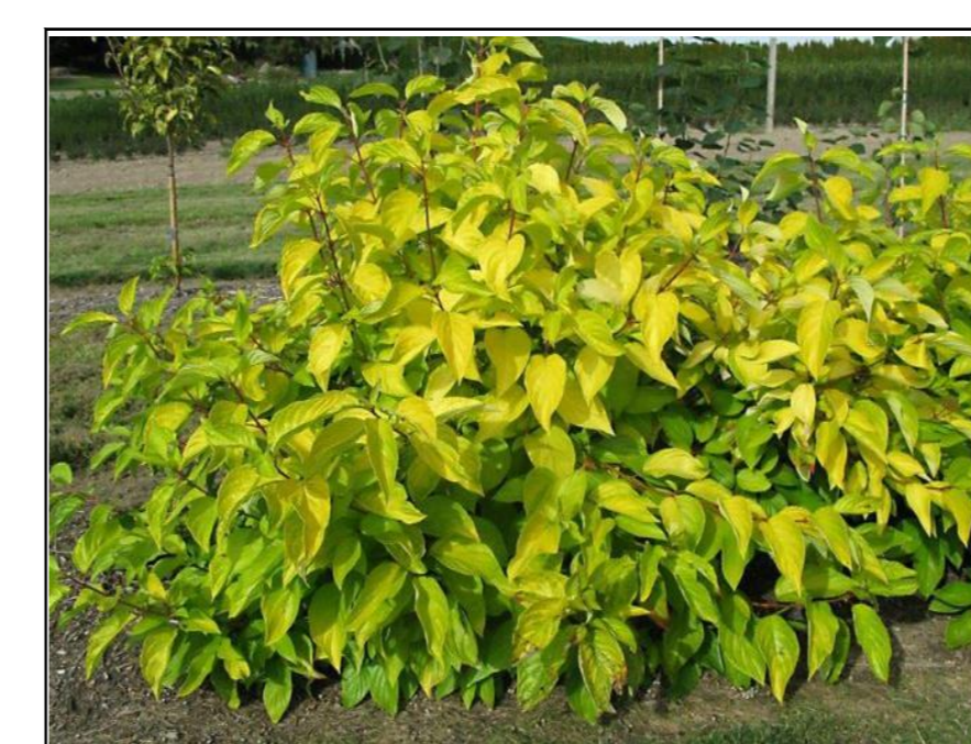
NEON BURST DOGWOOD