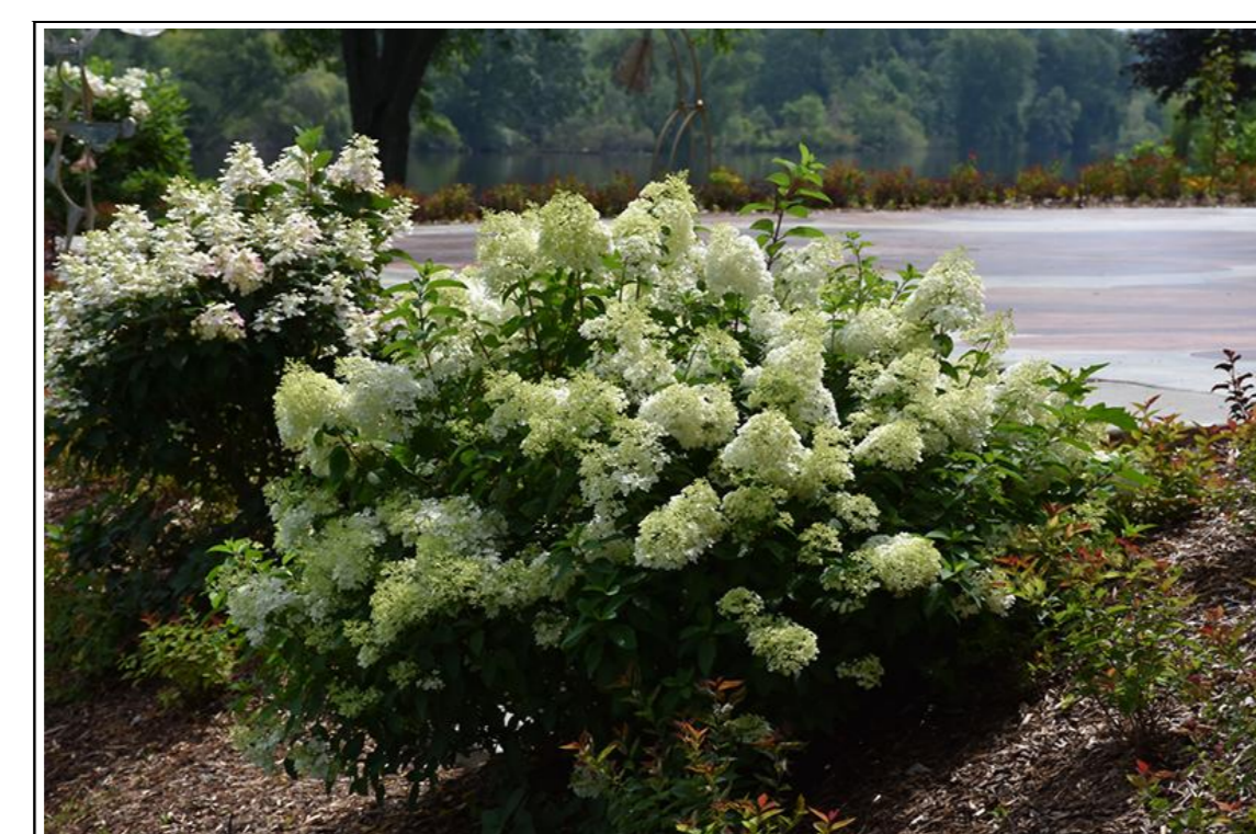
LITTLE LIME HYDRANGEA