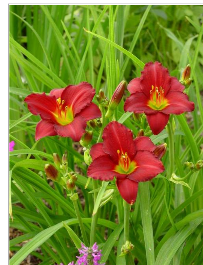
PARDON ME DAYLILY