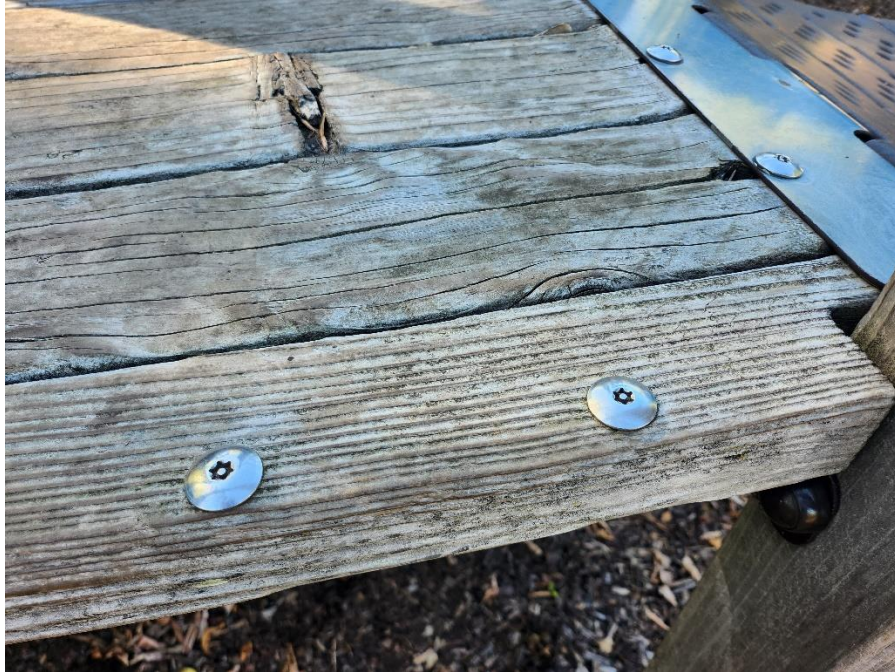
Existing deck conditions, and stainless deck fasteners