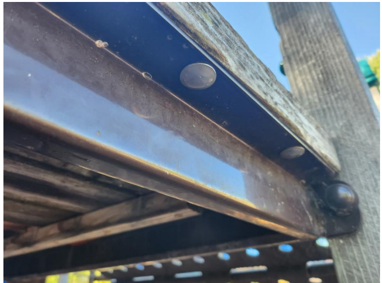
Bottom side of same deck fasteners