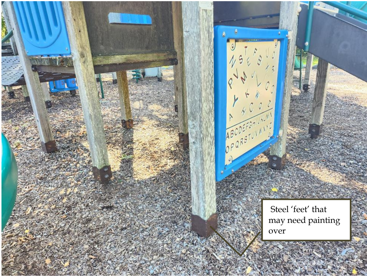
Example vertical posts to be scuffed/prepped and stained.