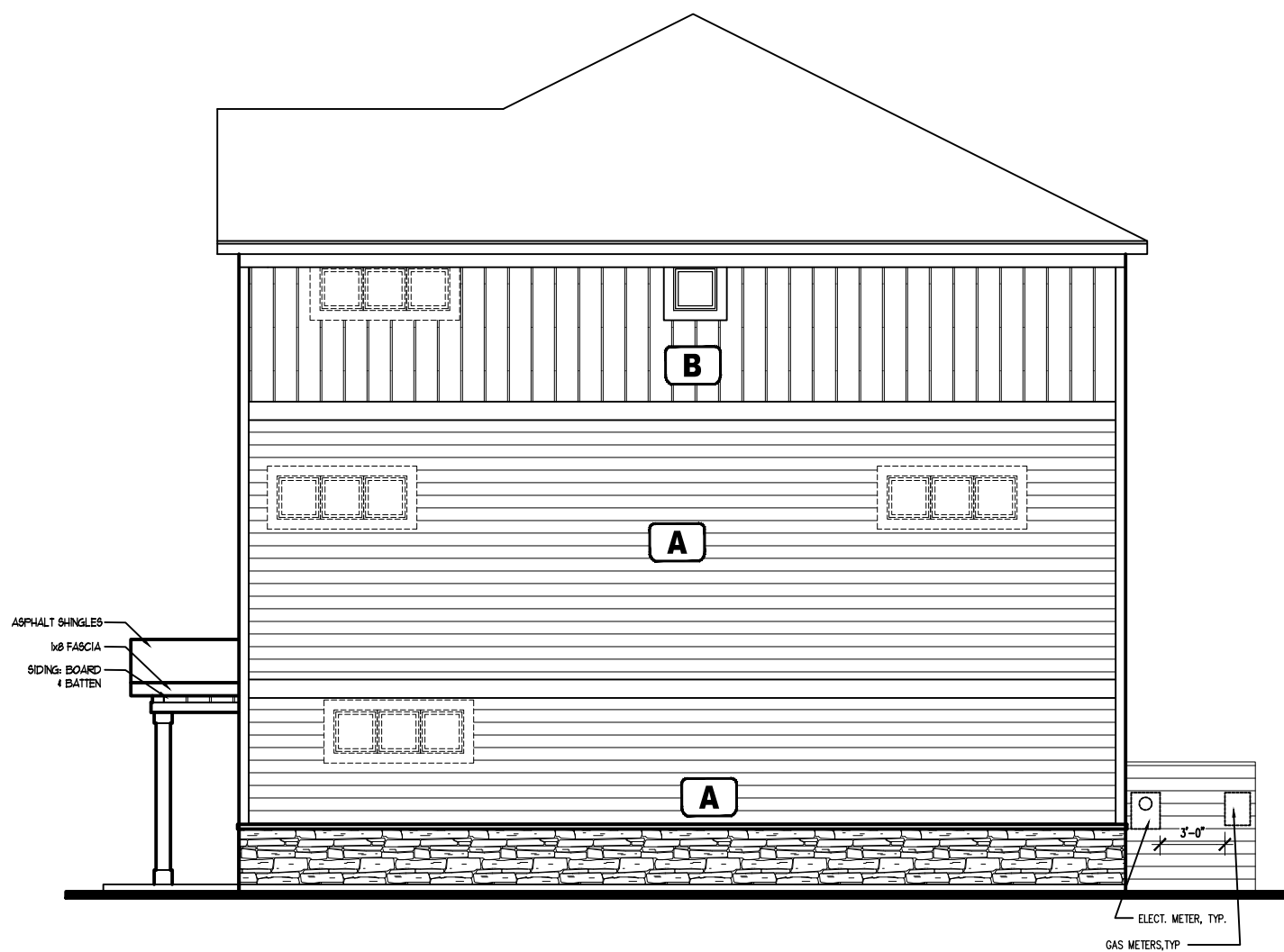
2 Right Elevation - Opt Stone Loc. B 1/8"=1'-0"