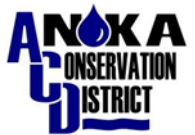
Exhibit B – Operation & Maintenance Plan