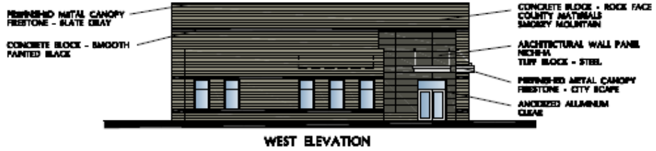
EXHIBIT B (Continued)