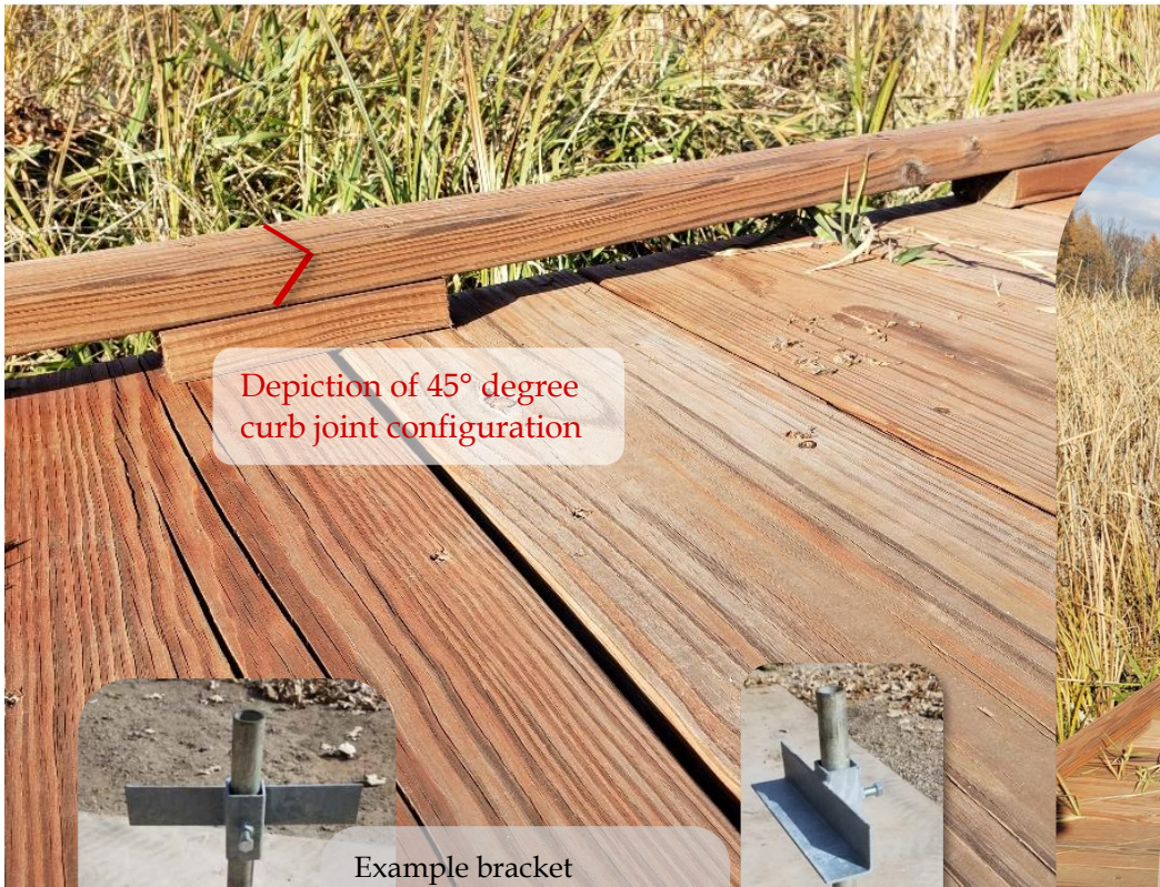
Depiction of 45° degree curb joint configuration