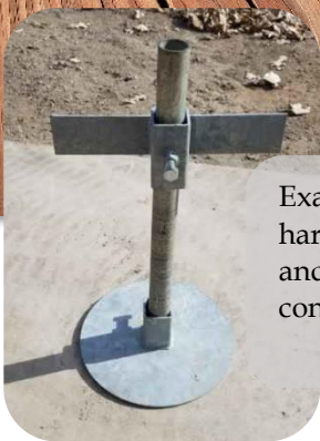
Example bracket hardware, mud foot plate and pipe, if used , at contractor's discretion