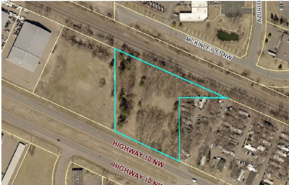
Figure 1: Parcel Purchased with RALF Loan L0502

The RALF loan agreement between the Council and the City provides that, when RALF property is no longer needed for highway improvements, the City obtains the Council's approval to sell it at fair market value. Upon remittance of the sale proceeds to the Council, the Council discharges the RALF loan, usually after the highway improvements are complete. In this case a partial sale is proposed while the highway project is underway.