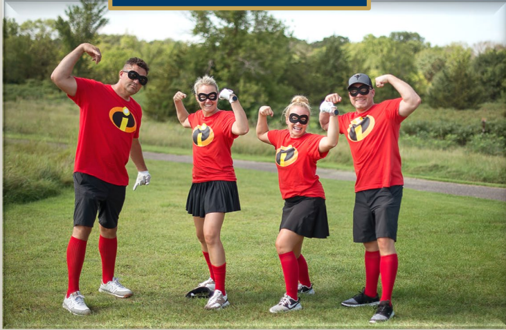
Best Dressed: BFirst Industrial