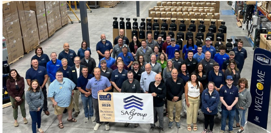
Ramsey Resident | September/October | 2025