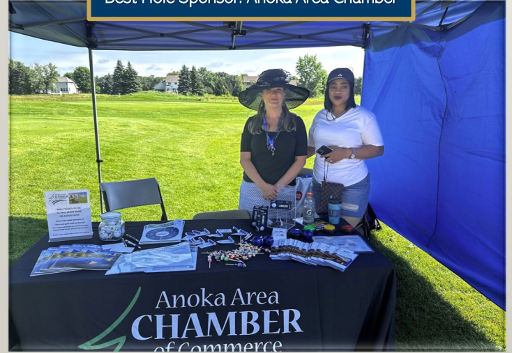
Best Hole Sponsor: Anoka Area Chamber