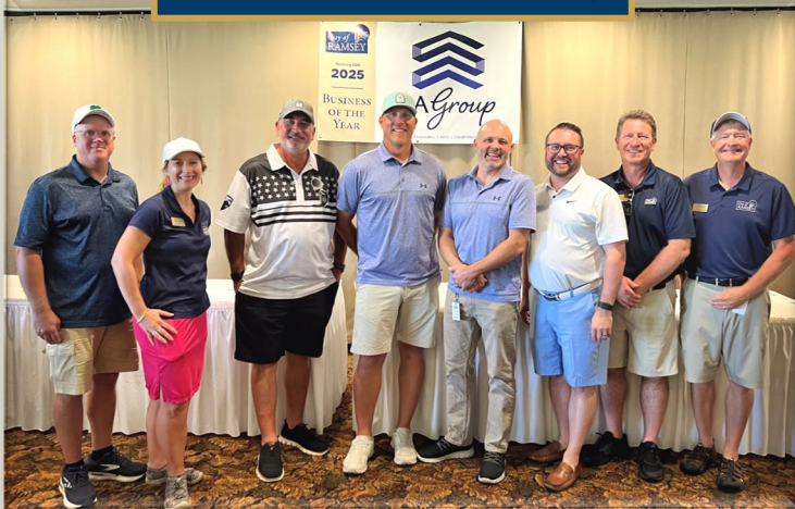
2025 Business of the Year: SA Group