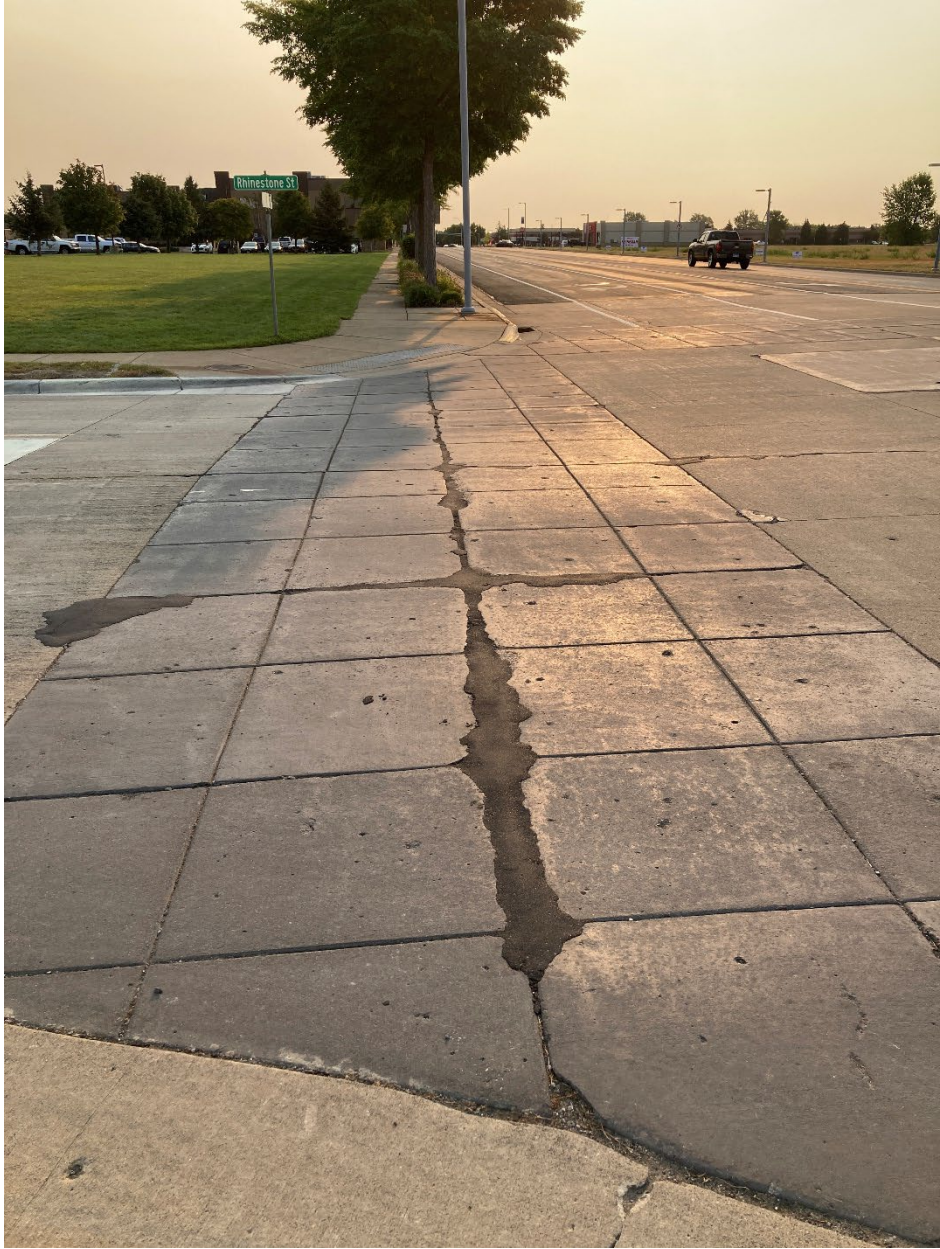
NW Quad Sunwood Drive & Rhinestone Street; Facing East