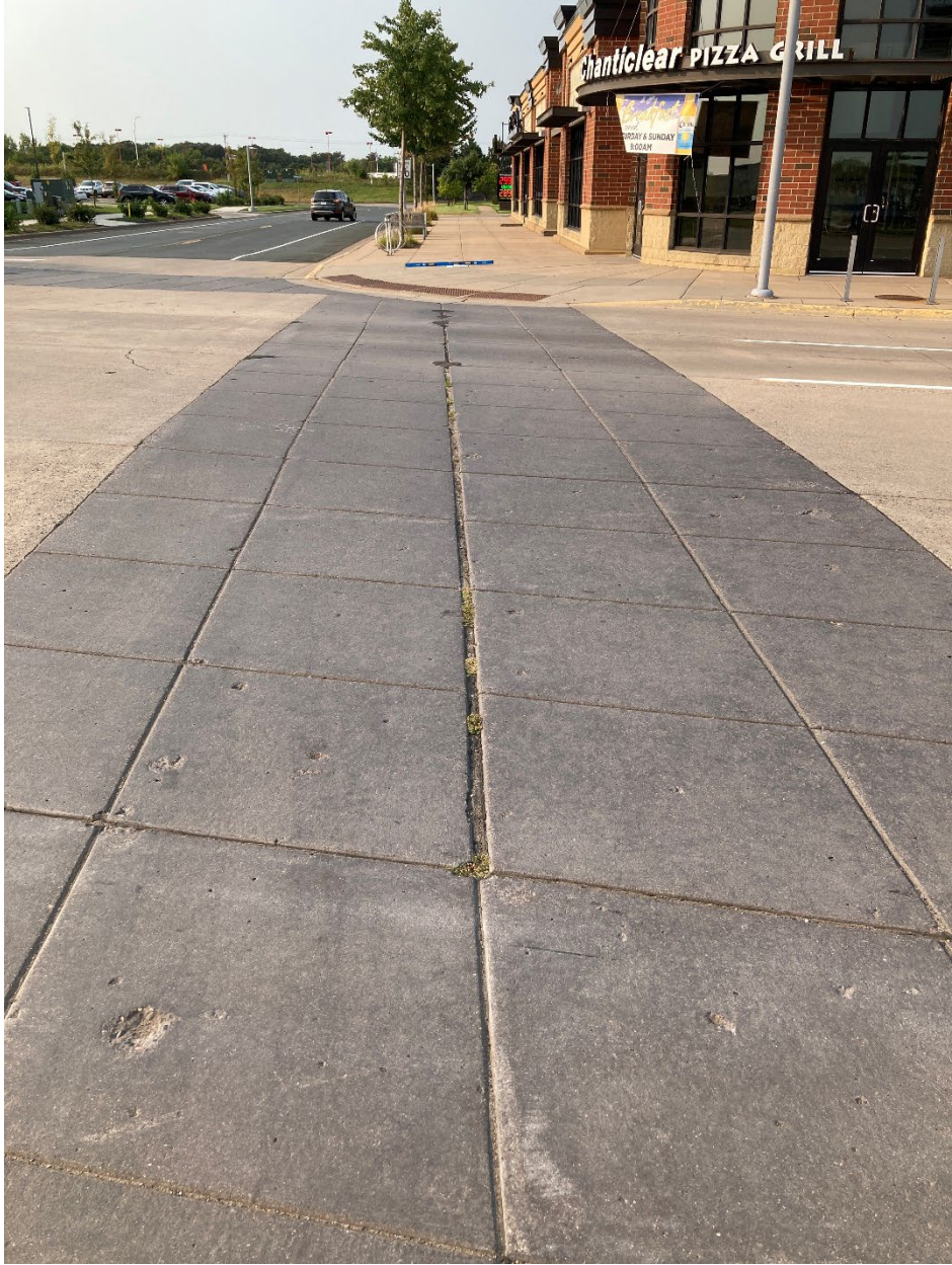
NW Quad Sunwood Drive & Zeolite Street; Facing South