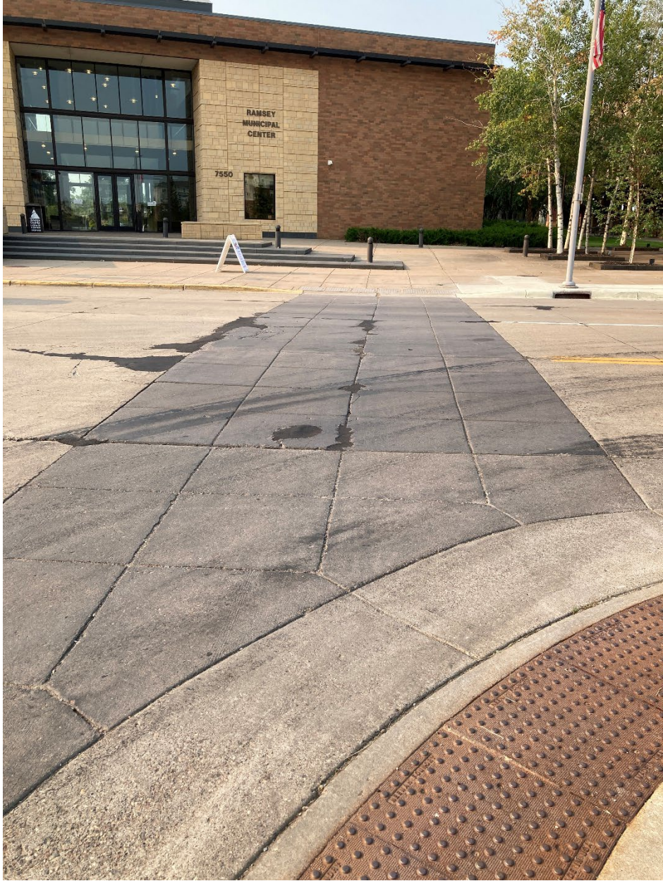
NW Quad Sunwood Drive & Center Street; Facing South