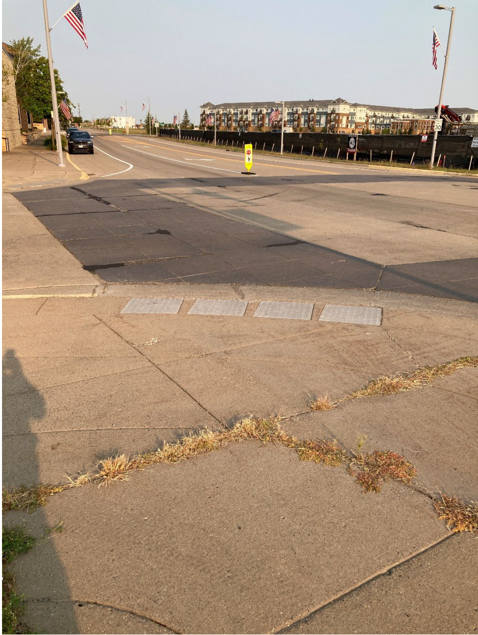
SE Quad Sunwood Drive & Sapphire Street; Facing West