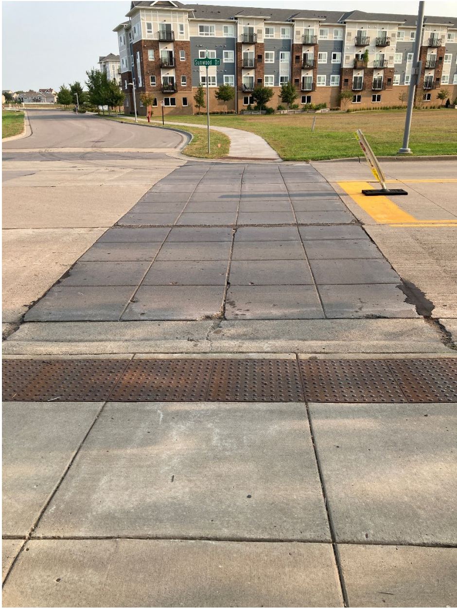
SE Quad Sunwood Drive & Willemite Street; Facing North