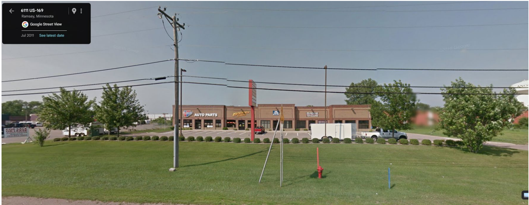
July 2011 Google Street View