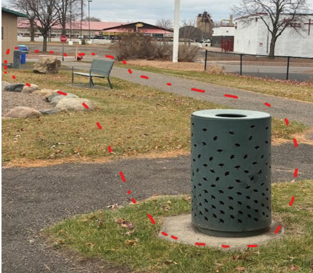
Benches, fountain and trash can to be protected.