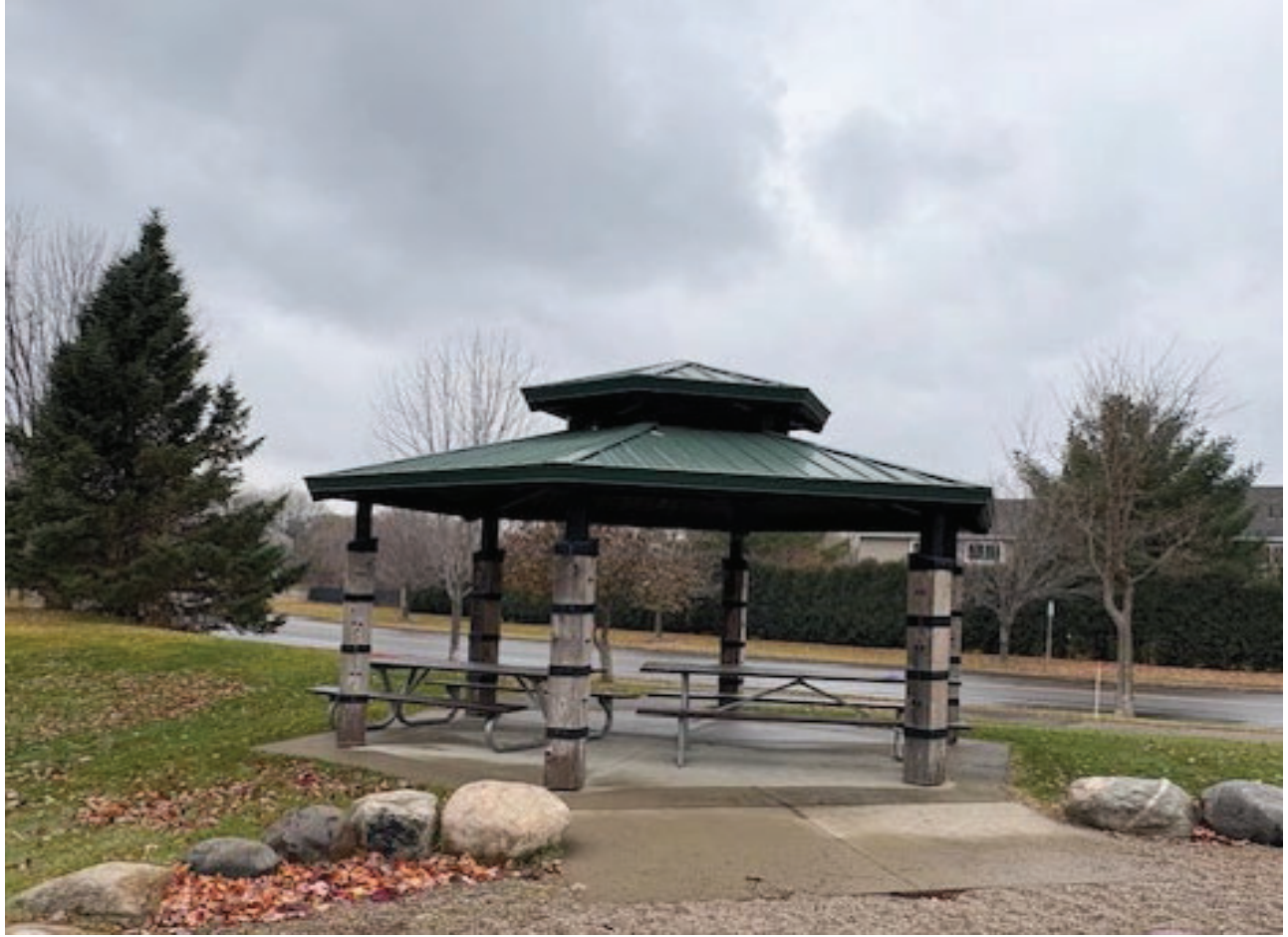
Pavilion and concrete to be protected.