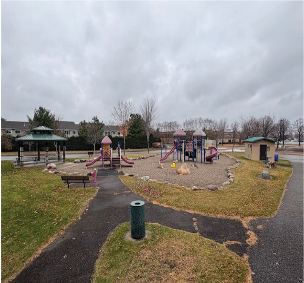
Play equipment to be removed/recycled.