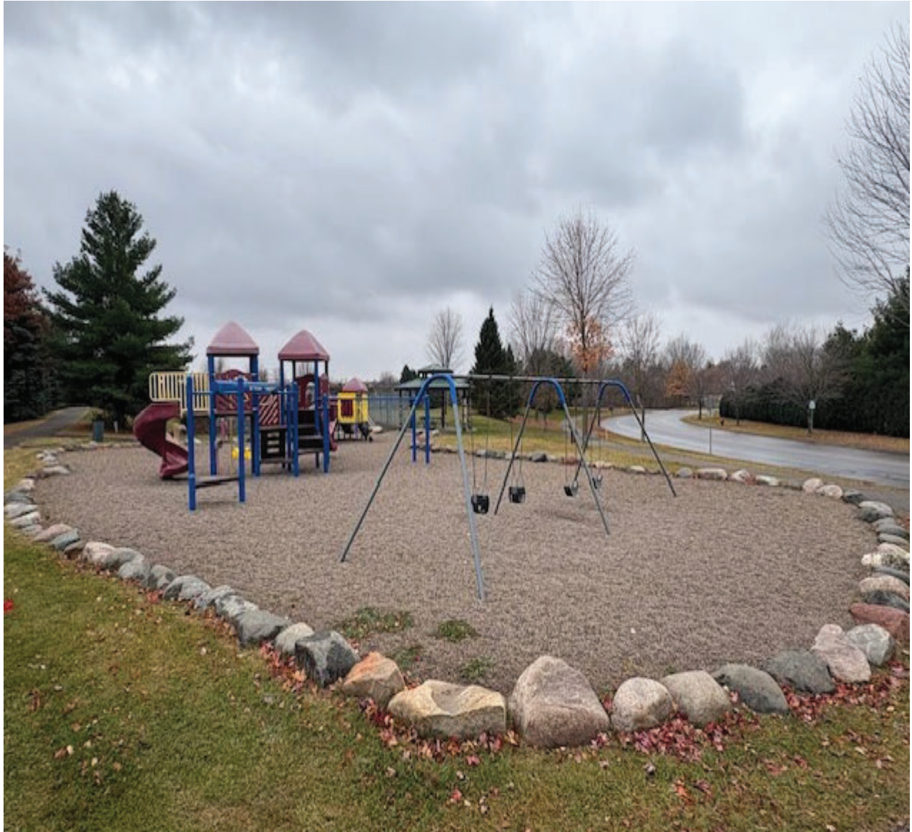
Play equipment to be removed/recycled.