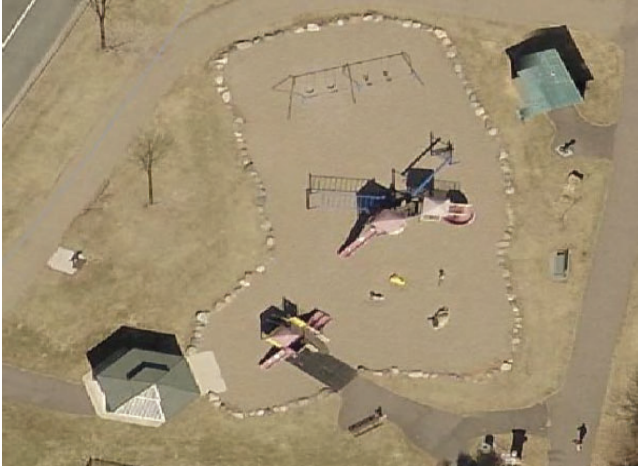
Boulders will remain at site to serve as a border.