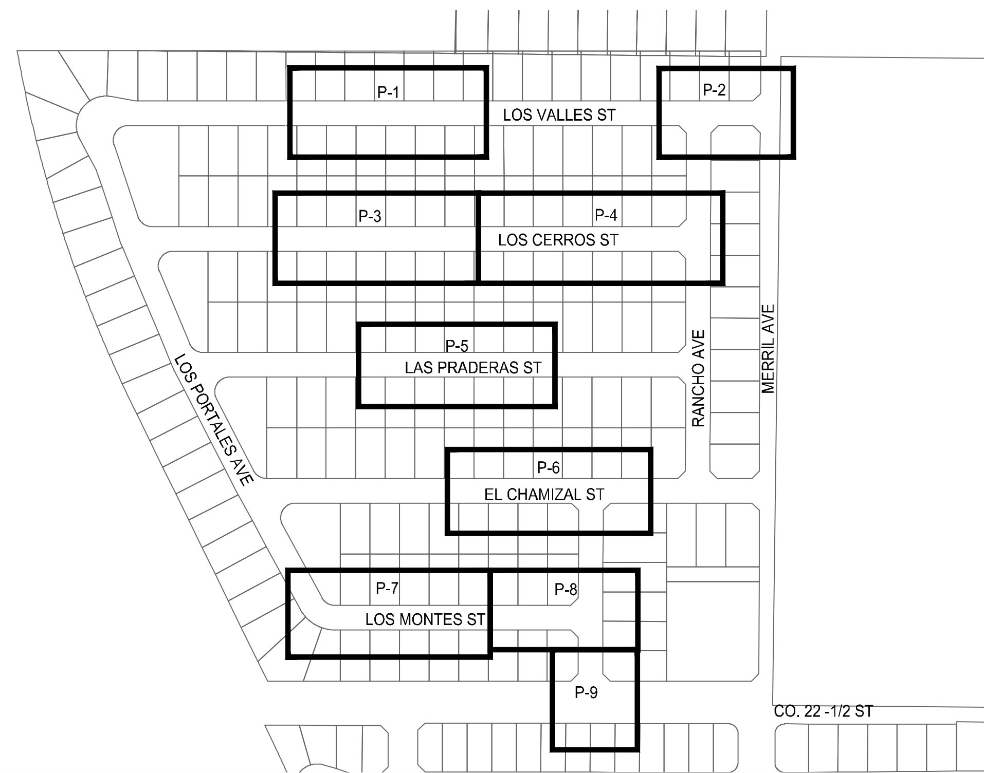
KEY MAP NTS