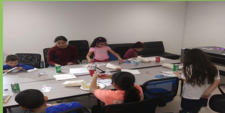
Art and Crafts