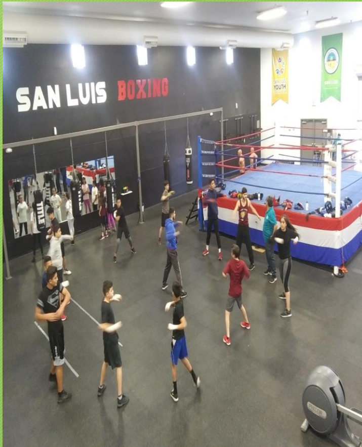
SL Boxing Club