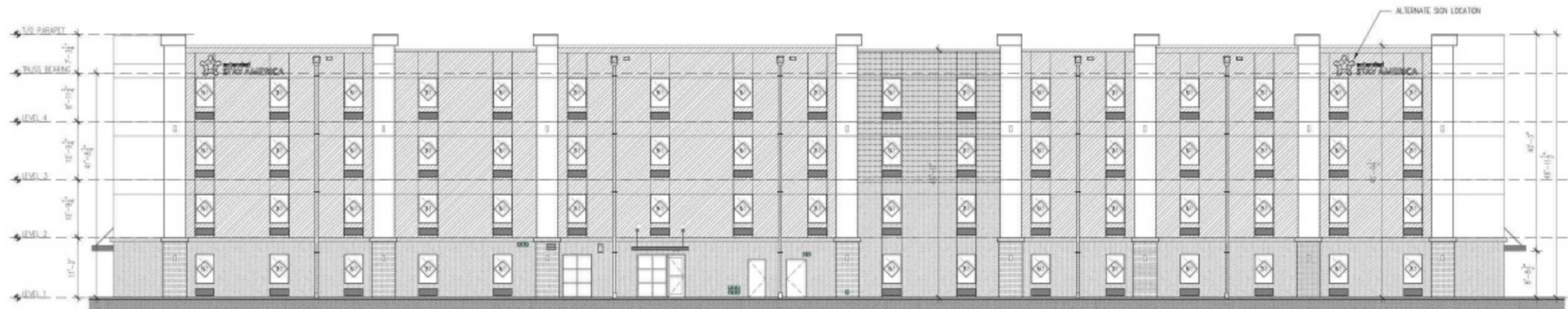
BACK ELEVATION Scale: 1/8"=1'-0"