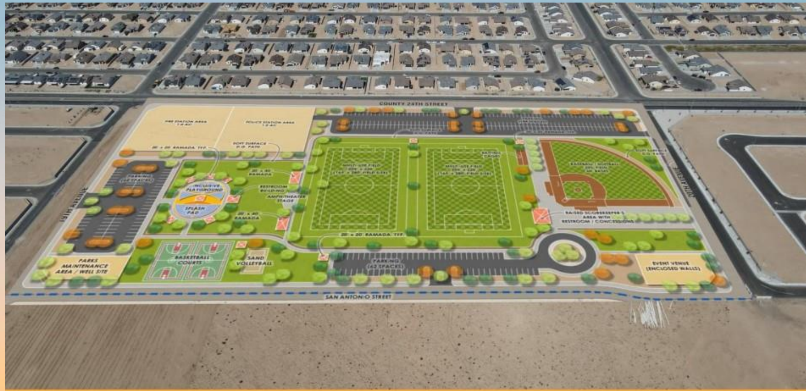
East Community Park