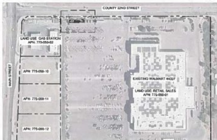
OVERALL SITE PLAN SCALE 1" = 150'