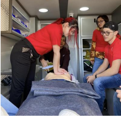
EMS Students practicing skills in new ambulance simulator.