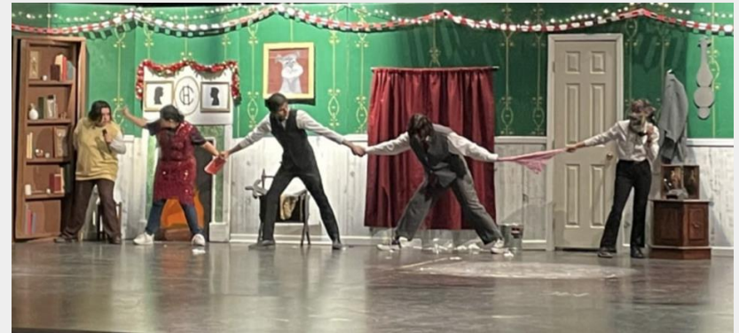
The Play That Goes Wrong