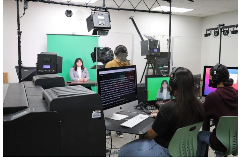
New Lab area