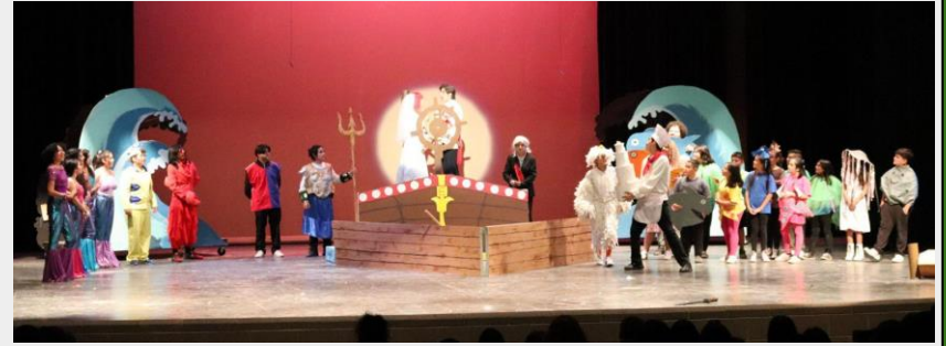
The Little Mermaid