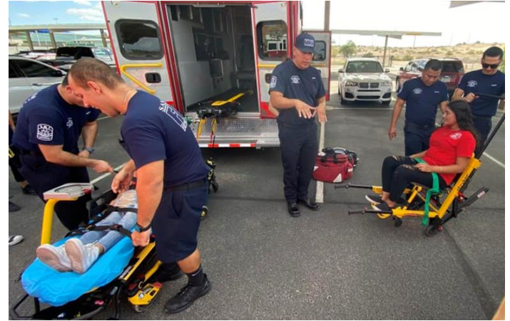
San Luis Fire Department assisting our students with skills checks.