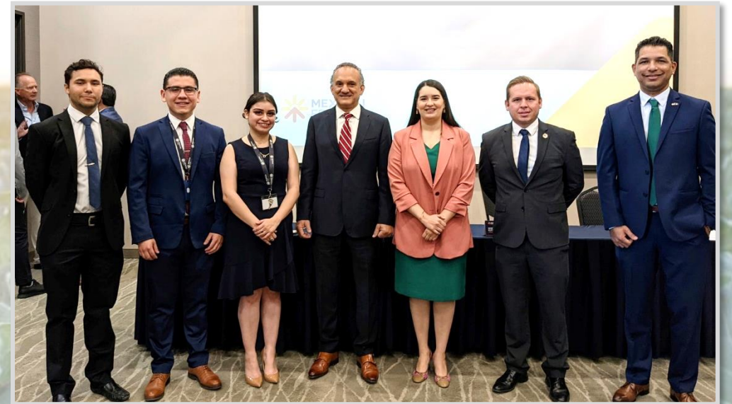
(Mexicali EDC swearing-in ceremony in Mexicali | March 2022)