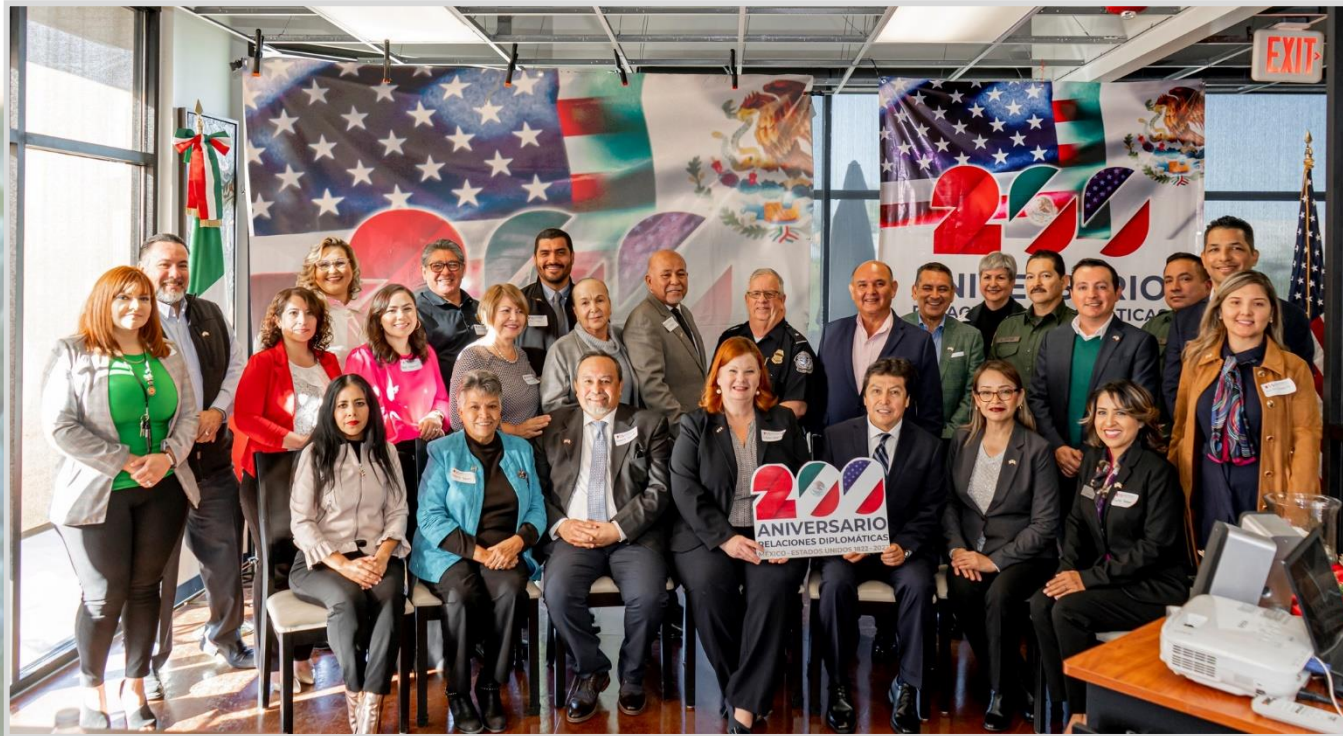
(200 TH Anniversary of Diplomatic Relations US-Mexico | December 2022)