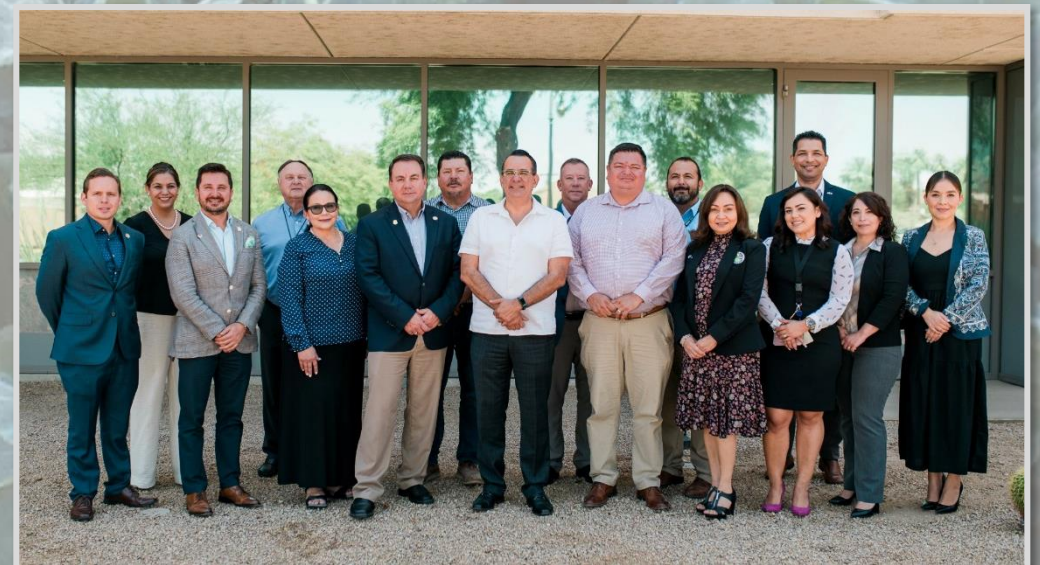
(Meeting with State of Baja representatives | August 2022)