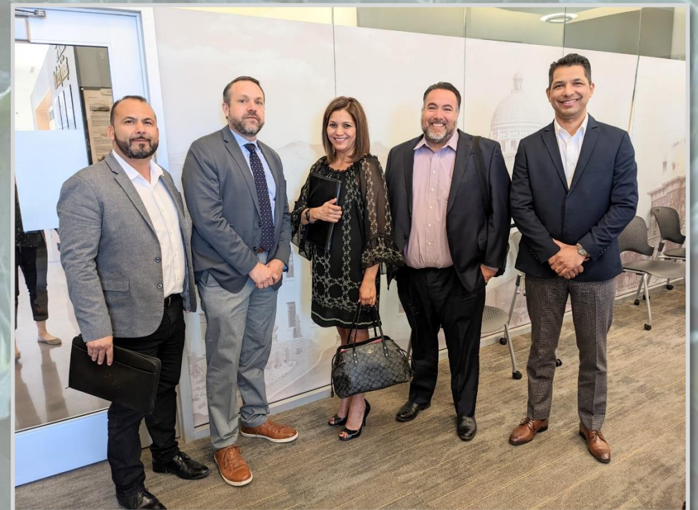
(NAD Bank Meeting in Tucson, AZ | April 2022)