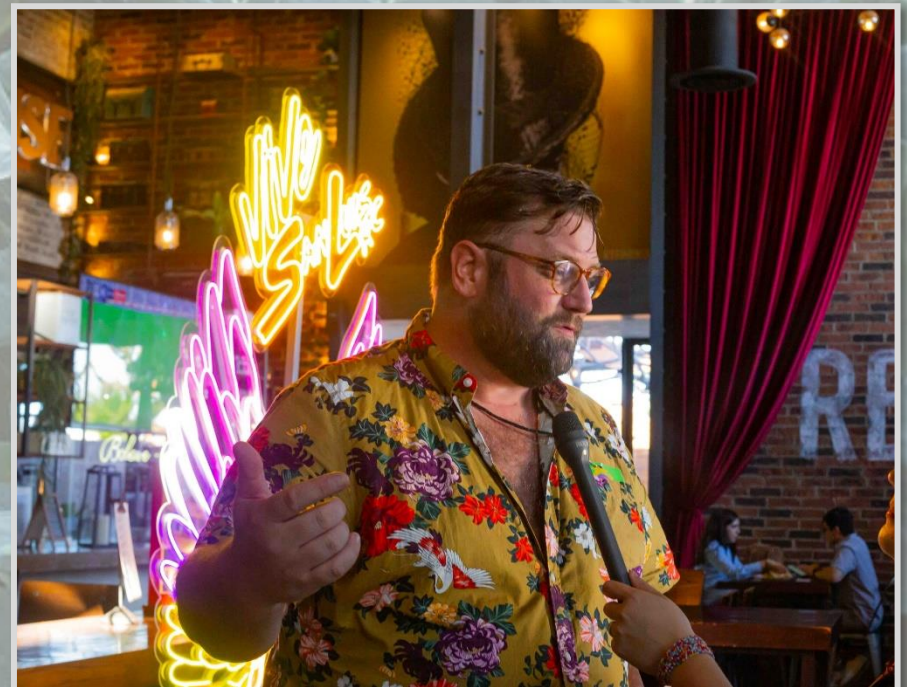
(Culinary Tour "Nice Tour Meet You" | October 2022)