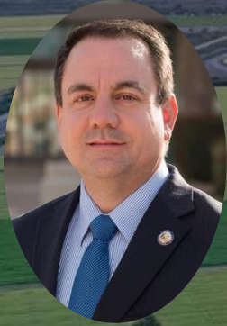
DOUGLAS NICHOLLS MAYOR OF YUMA