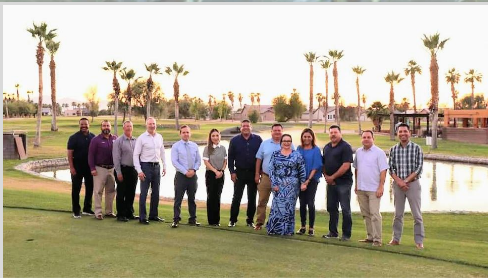
(4FrontED GGM in Wellton | May 2022)