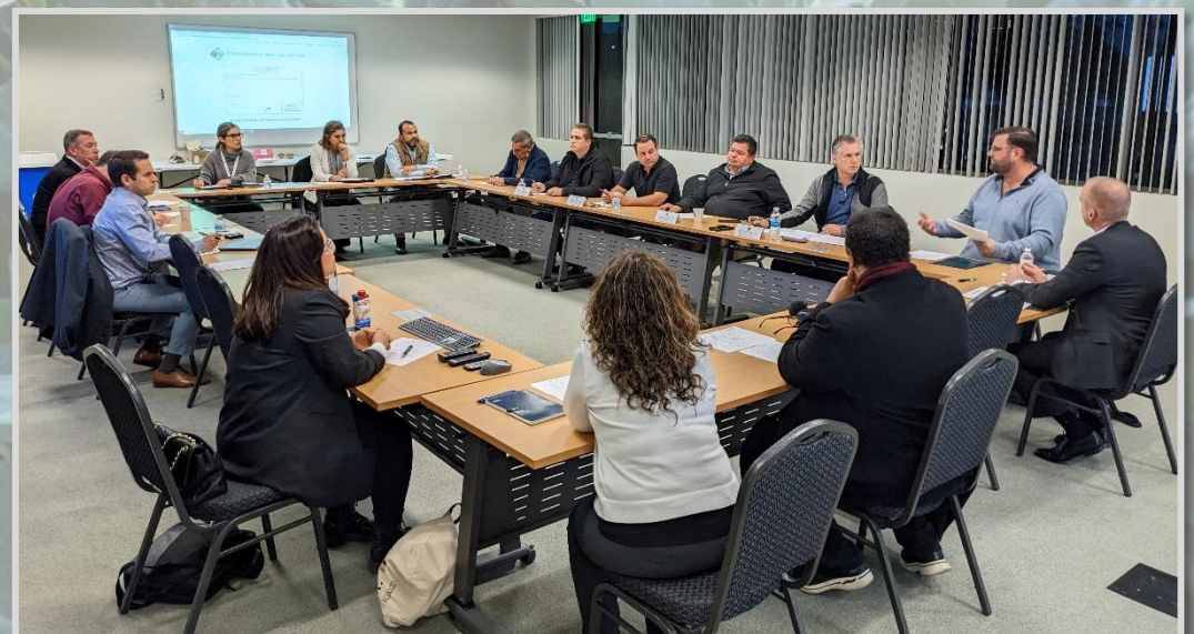
(4FrontED GGM at Yuma City Hall | January 2023)