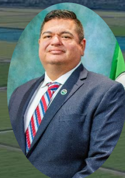
GERARDO ANAYA MAYOR OF SOMERTON