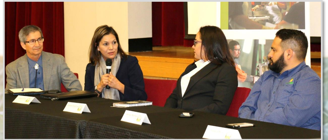
(Press conference Expo AgroBaja | Feb. 2020)