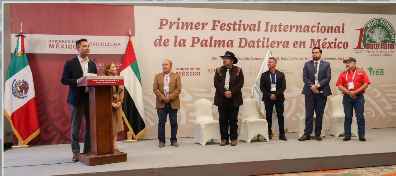
(1 st Mexico International Date Palm Festival in SLRC | November 2022)