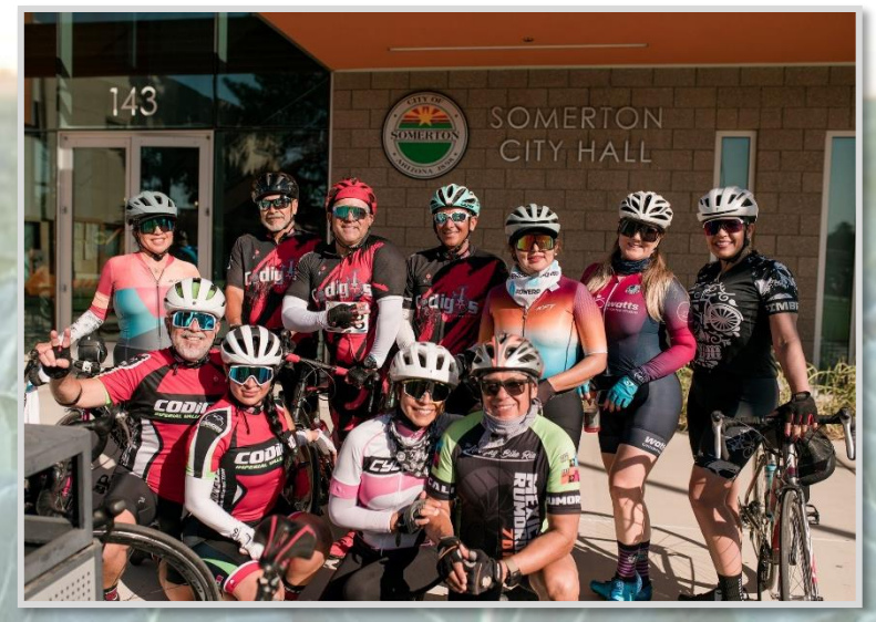
(6 th Mayors' International Bike Ride | October 2022)