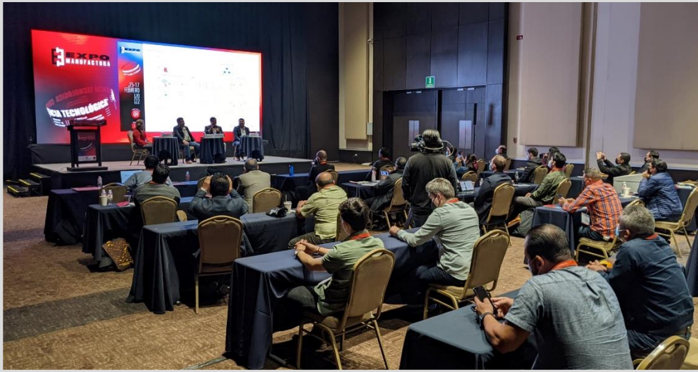
(Expo Manufactura in Monterrey, NL | Feb. 2022)