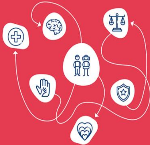
Process without a Family Advocacy Center