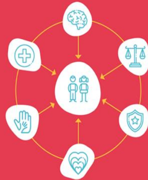
Process with a Family Advocacy Center MDT