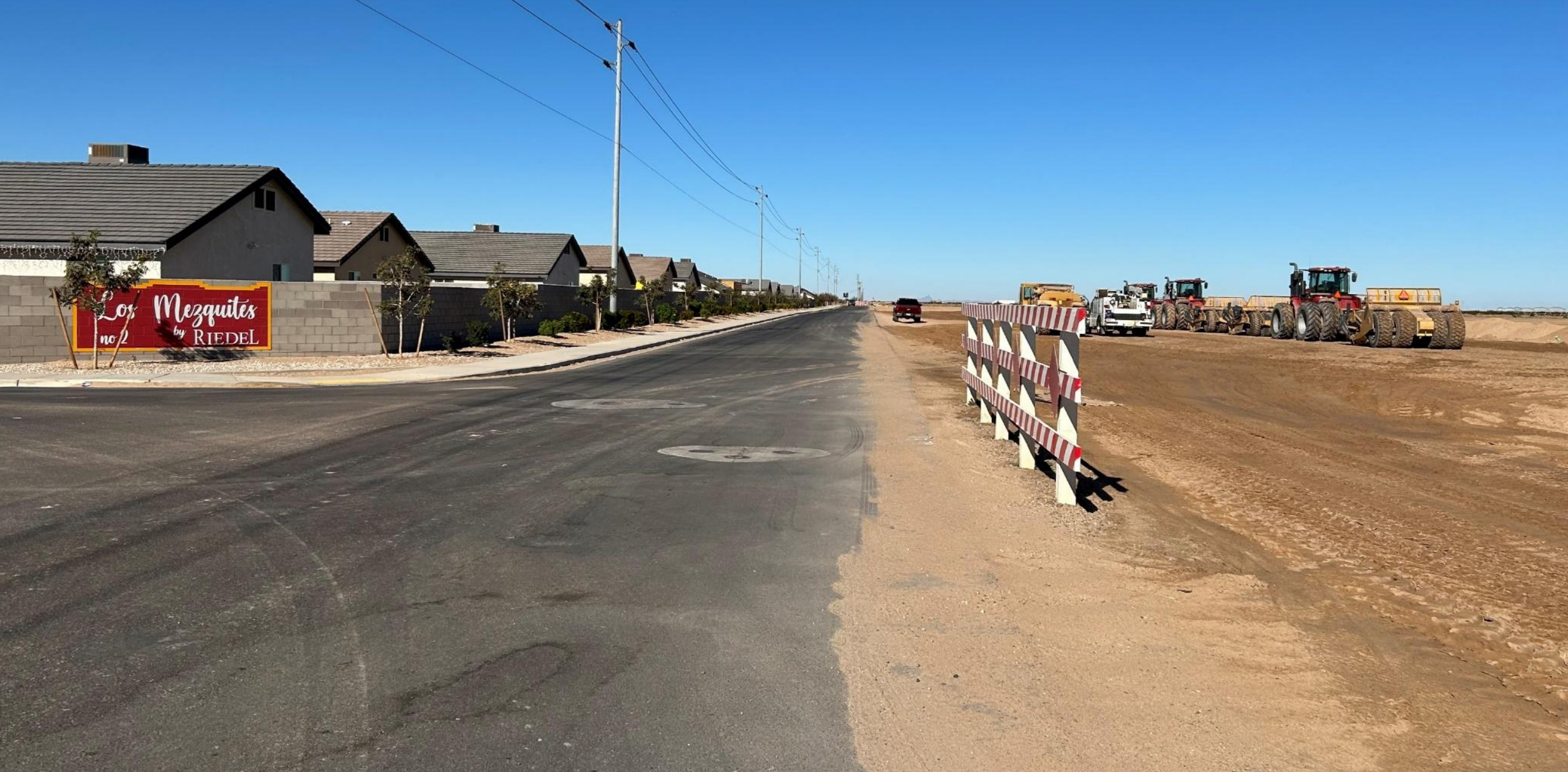
Looking north from subject property