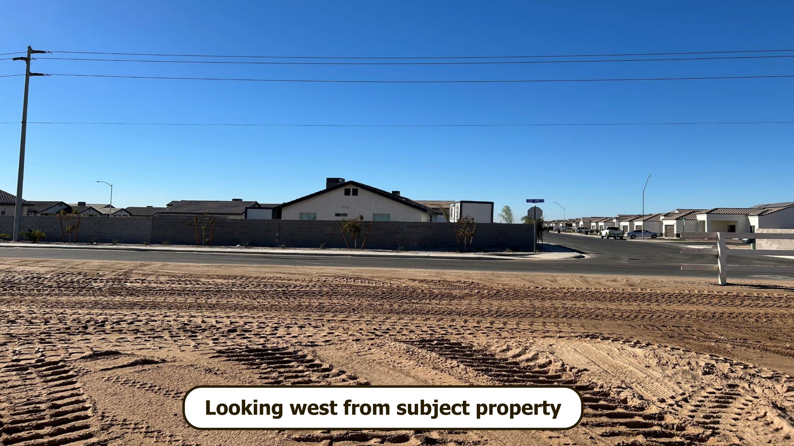
Looking west from subject property