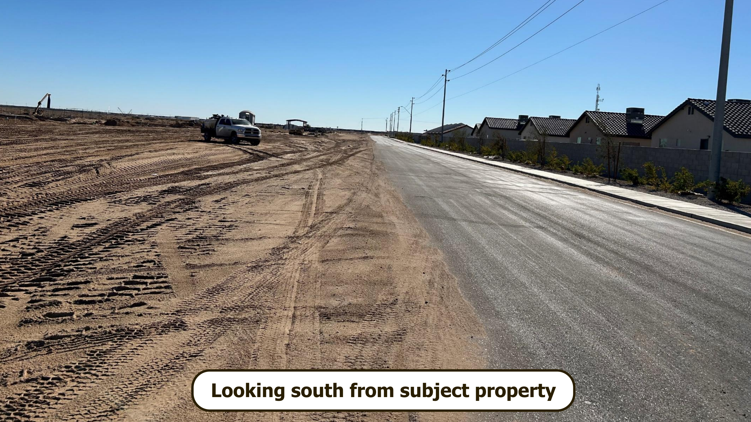
Looking south from subject property