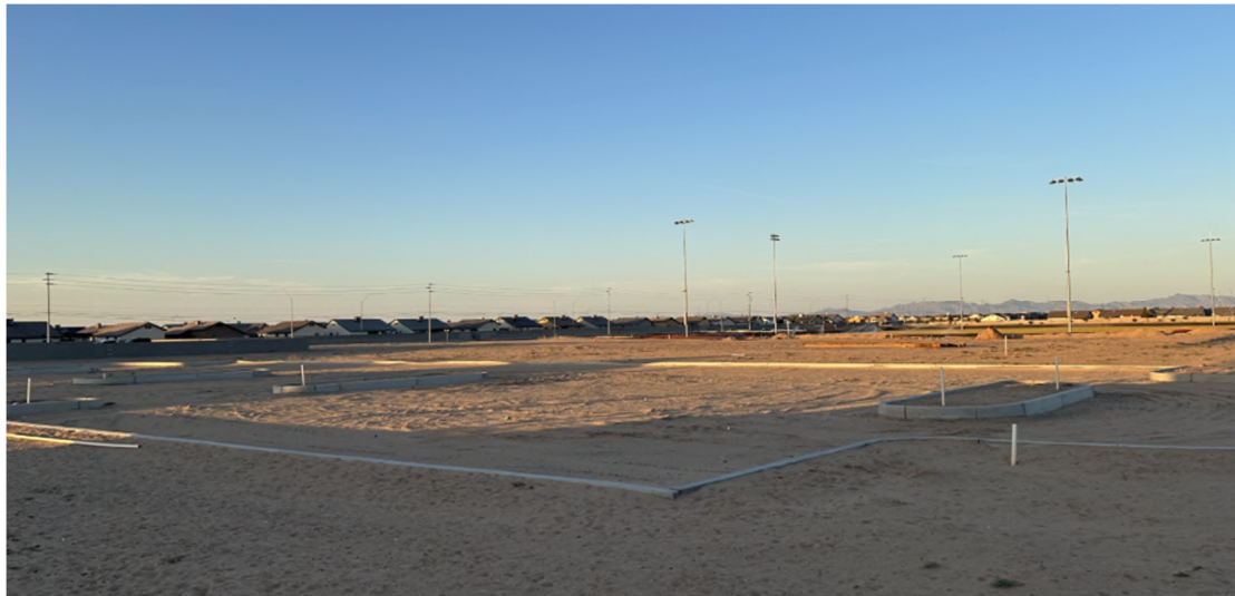
West Parking Lot