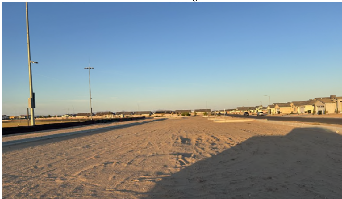
South Parking Lot