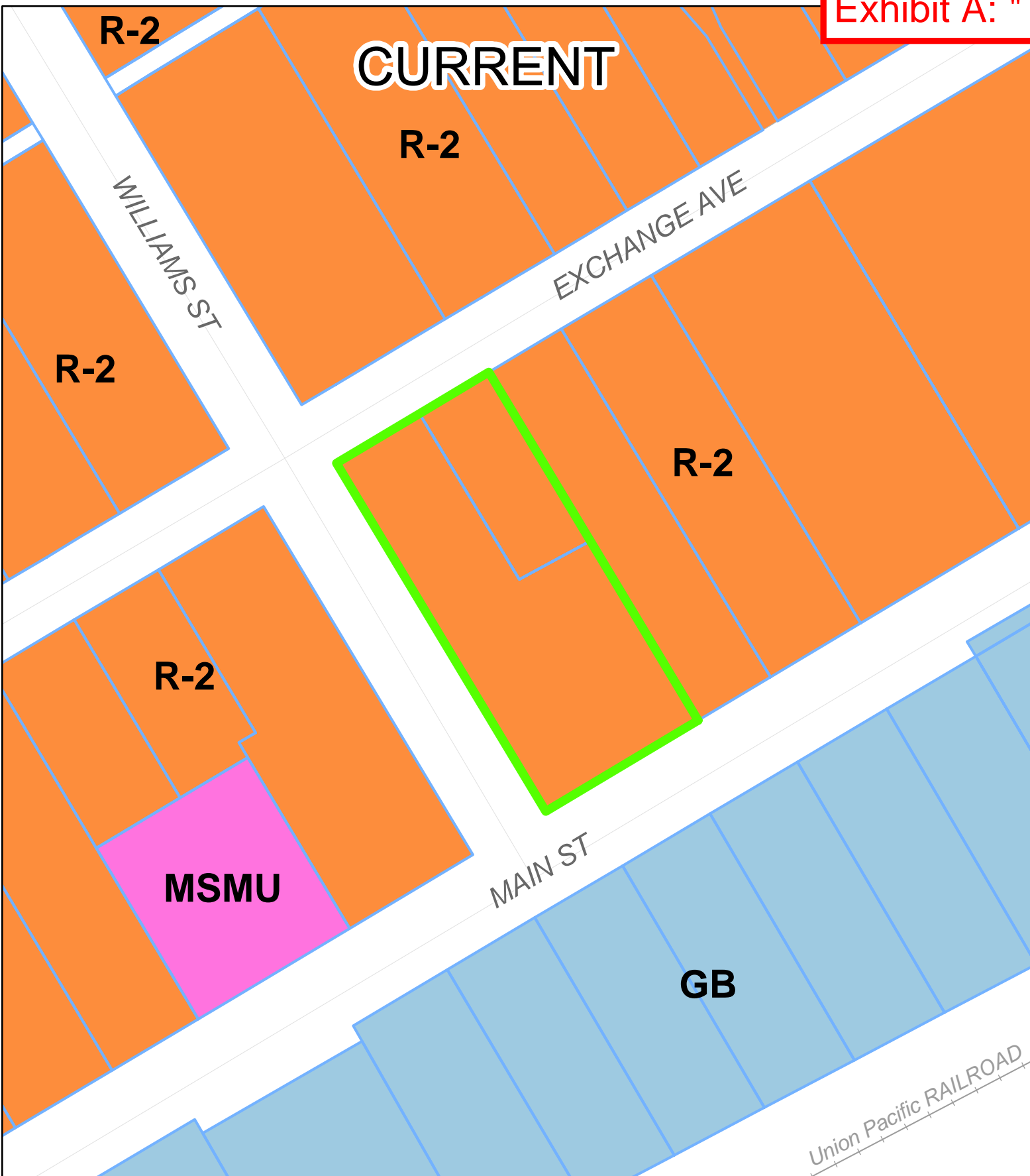
Exhibit A: "The Property"