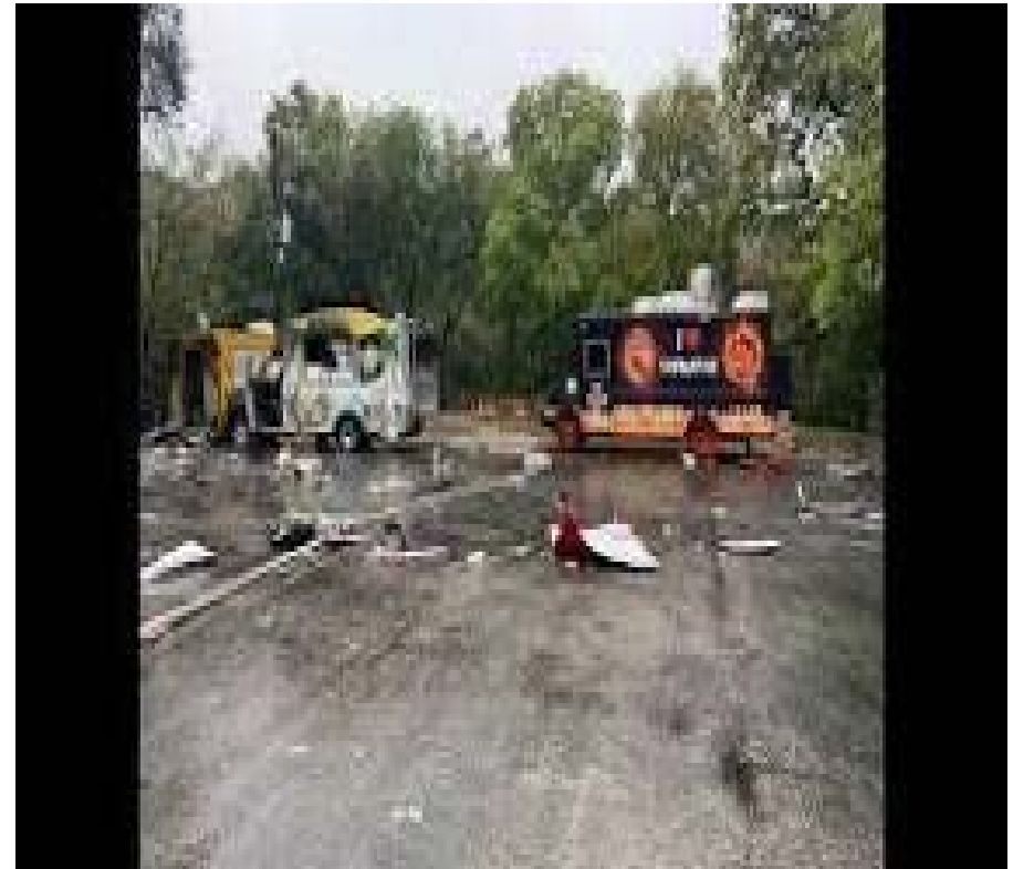
Food Truck explosion in San Marcos, Texas Nov. 14, 2019