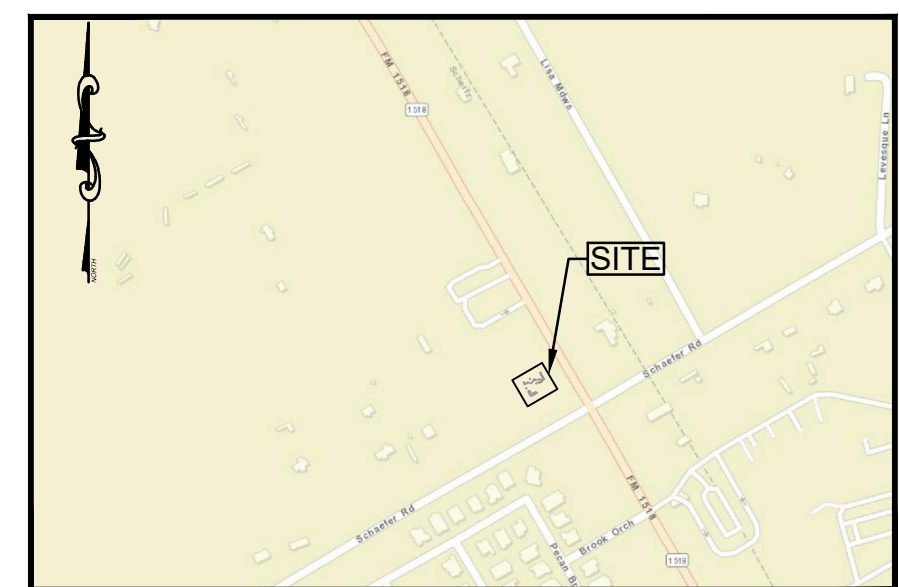
VICINITY MAP SCALE: 1"=5,000'