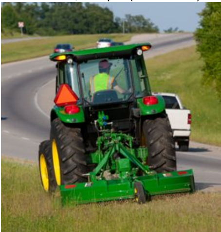
HX6 and HX7 deliver a clean cut