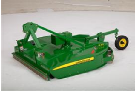
Exclusive double-deck in HX6

dome-shaped decks provide easy cleaning and water runs off for longer product life. Deck thickness increases as the size and cutter duty level increases.