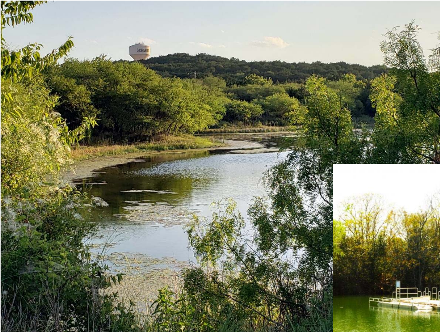
Pond and Fishing Pier