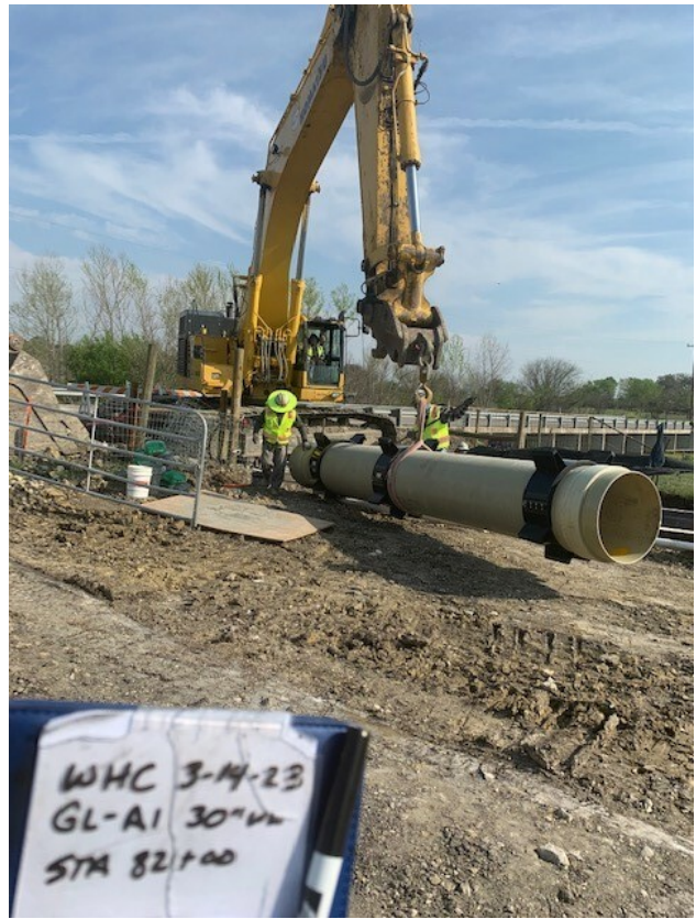
30" pipe with spacers to be inserted in casing below Trainer Hale Road