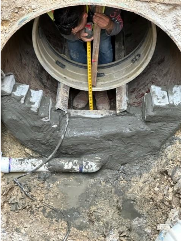
Placement of 30” carrier pipe into 48” steel casing crossing Woman Hollering Creek