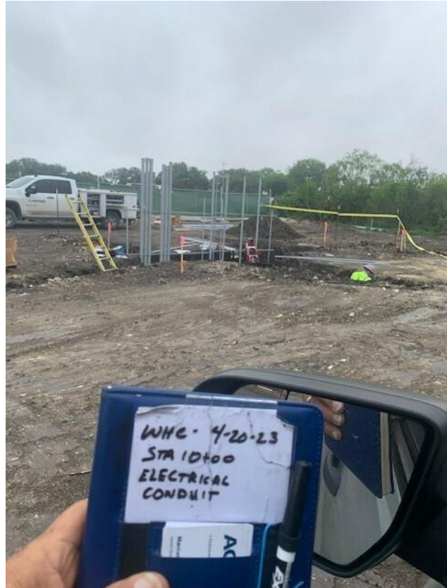
Electrical conduit installation at lift station site