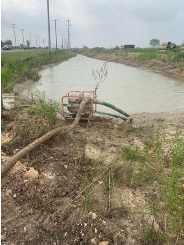
dewatering of trench for installation of gravity main on west side of FM 1518