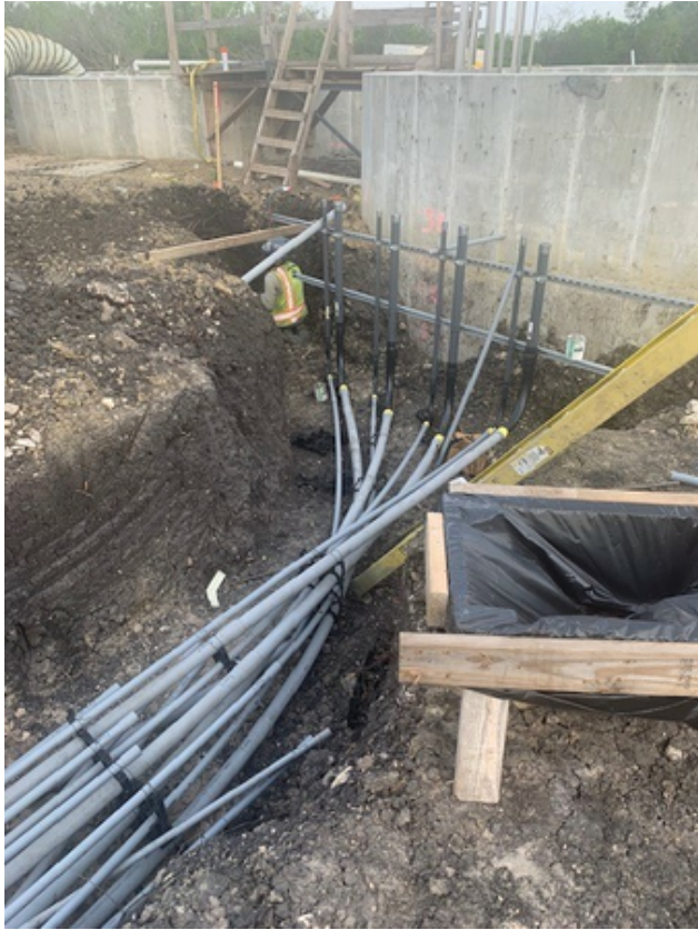
electrical conduit at lift station site