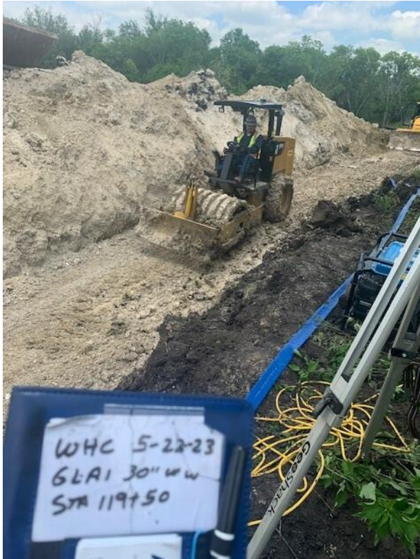
Compaction of backfill in pipe trench