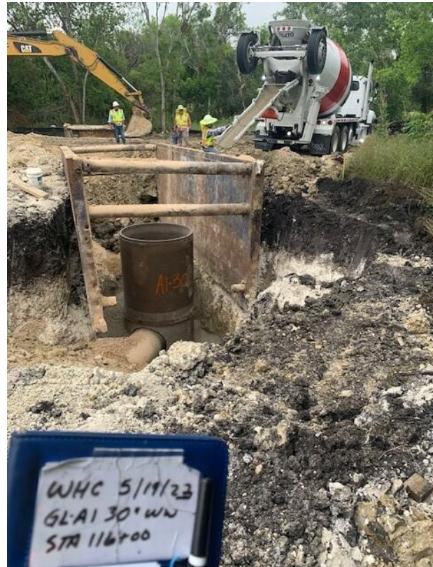
Placement of flowable fill around manhole