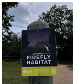
Certified Firefly Habitat Post