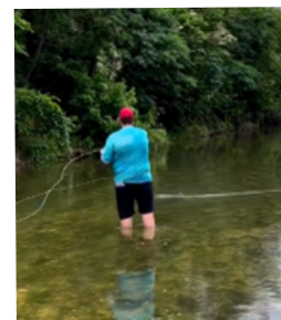
Fathers Day/Go Fishing Day Video