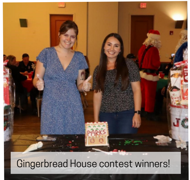
Gingerbread House contest winners!