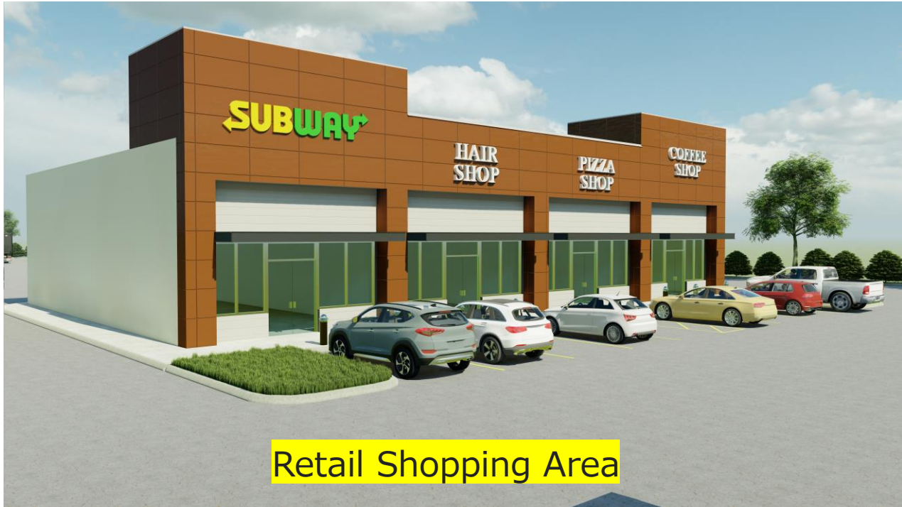
Retail Shopping Area