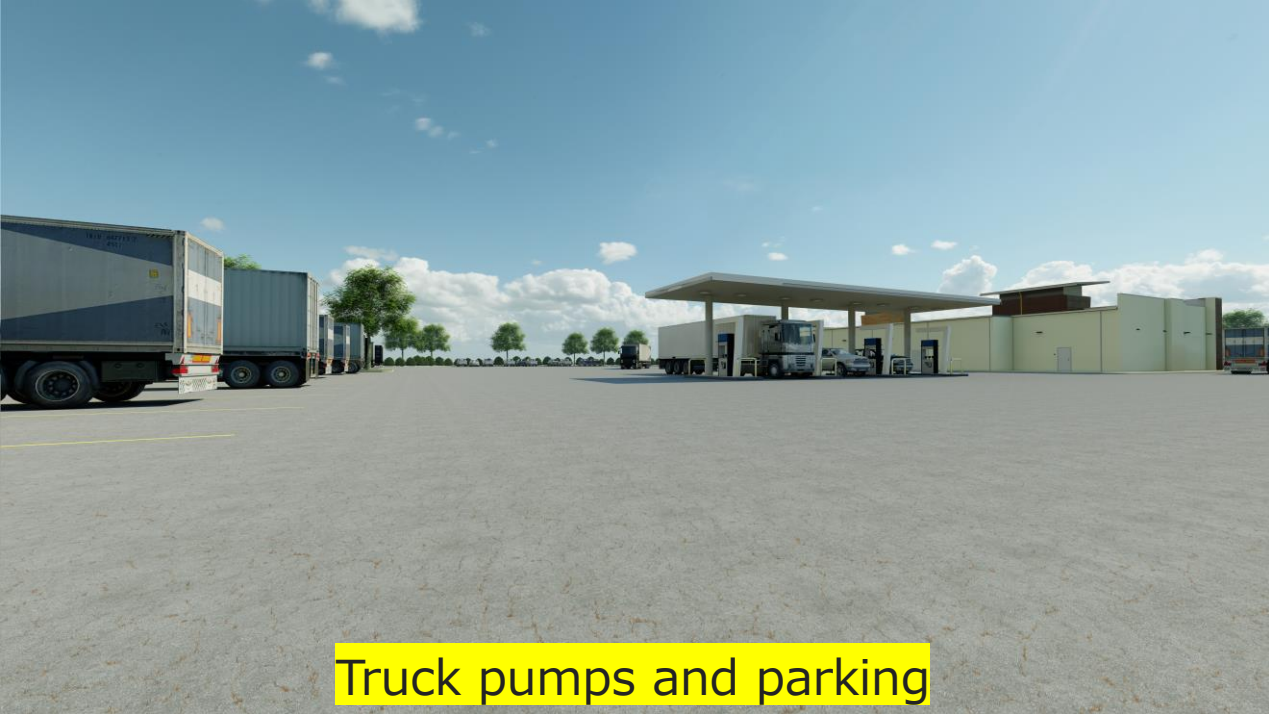
Truck pumps and parking