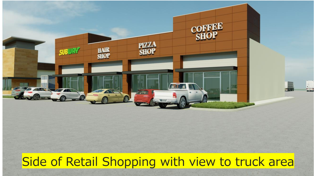
Side of Retail Shopping with view to truck area