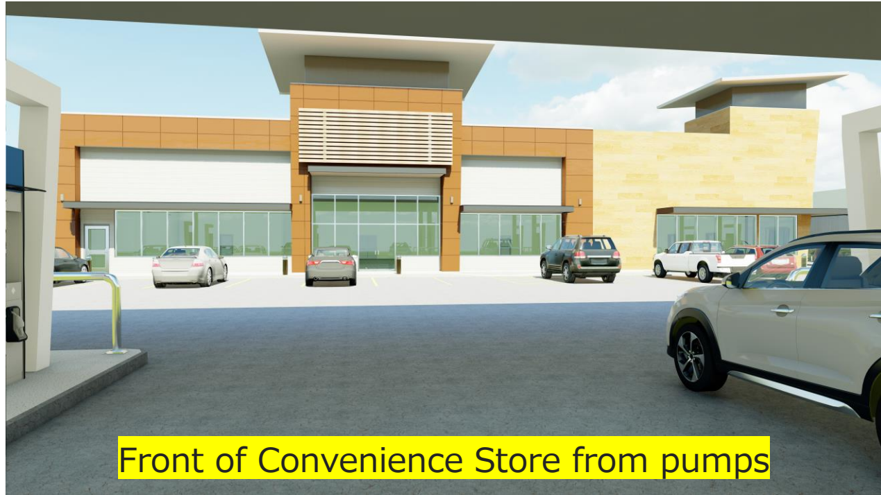
Front of Convenience Store from pumps