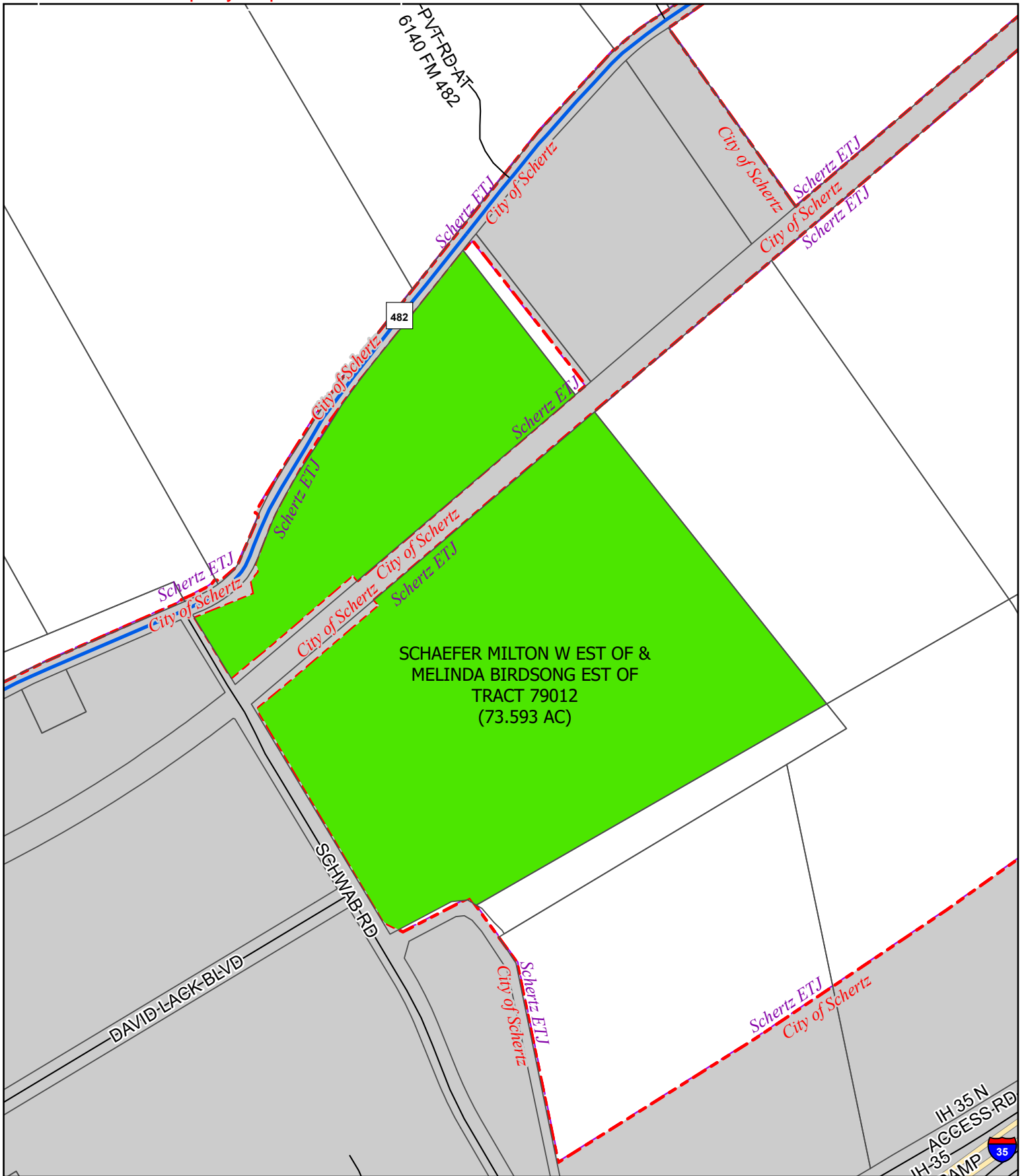
Exhibit "A": Property Depiction